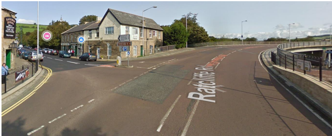
Figure 1: Existing road layout at the Radcliffe Road junction with Church Street

The B6319 road in the Haydon Bridge vicinity is a single carriageway subject to a 20 MPH speed limit, which is illuminated by street lighting at the location of the proposed works. A 'T-junction' is in place at its junction with Church Street where priority is given to motorists navigating through Ratcliffe Road and vehicles often have a significant wait to exit Church Street and manoeuvre onto the B road. The layout is also predominantly suited for vehicle priority, with no formal pedestrian crossing facilities present in a location where several local shops and businesses operate.