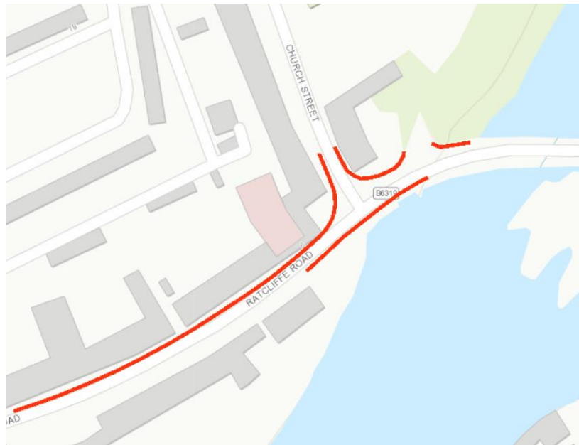
Figure 2: Red lines showing existing 'No Waiting at Any Time' (double yellow lines) restrictions

observed to be abusing this facility when visiting the local shops as other kerbside space on Church Street is at full capacity.