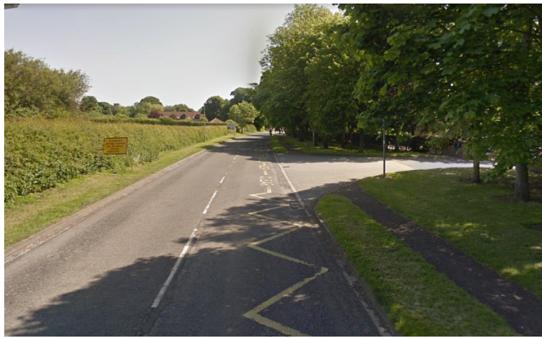
Photograph 1: Jubilee Road Existing Layout travelling eastbound

Photograph 1 gives an indication of the existing road layout when travelling eastbound on Jubilee Road