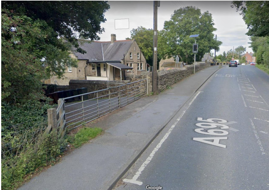
Fig 1: Private access adjacent to Mickley First School

Since the implementation of the original scheme, it has been identified that vehicles obstruct the access gates on this section of the A695 West Road at varied times outside the hours of 8am – 5pm during weekdays and weekends. Therefore, the restrictions associated with the 'School Keep Clear' markings are not considered to be robust enough when attempting to prohibit and discourage indiscriminate parking in this vicinity.