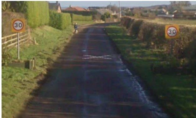
Photograph 1: C14 showing entry signs and faded road markings at the eastbound approach to Bowsden

Existing traffic signing and road markings are limited to speed limit entry signs and roundel road markings to advise motorists that the road reduces to 30 MPH from the National Speed Limit in the residential area at Bowsden.