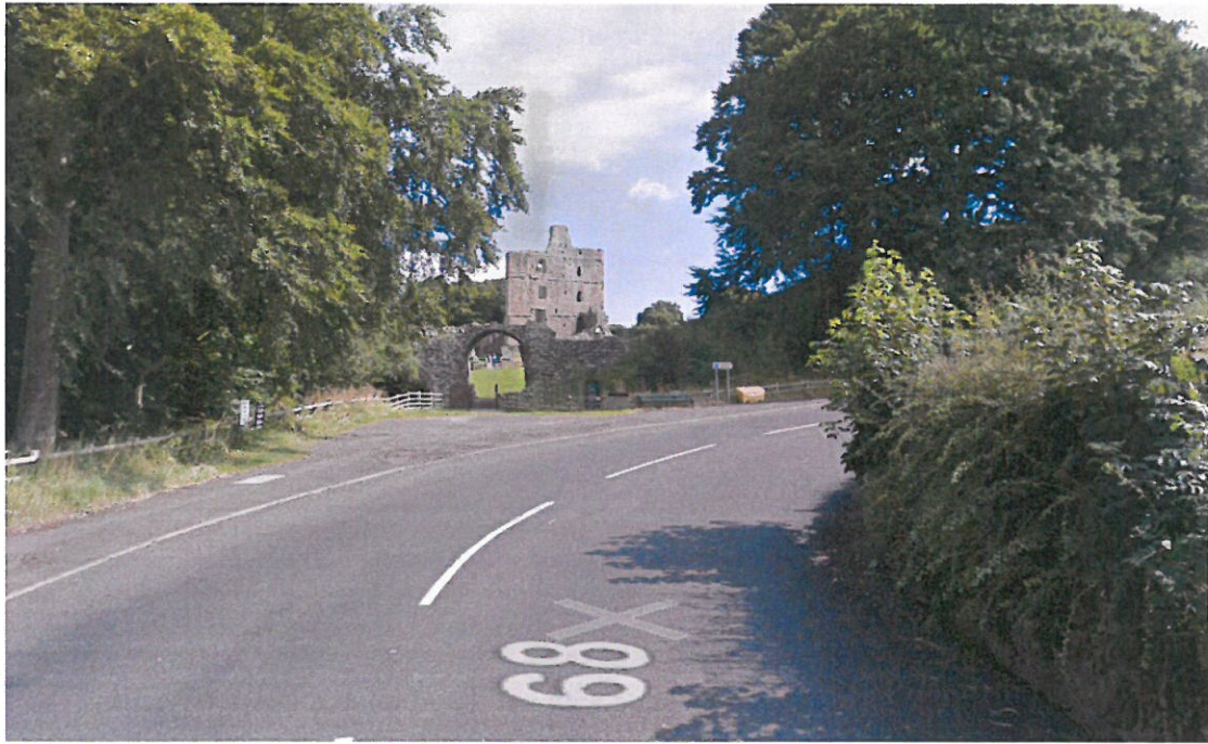
Photo 2. The bend at the top of the hill and the pedestrian access to Norham Castle.