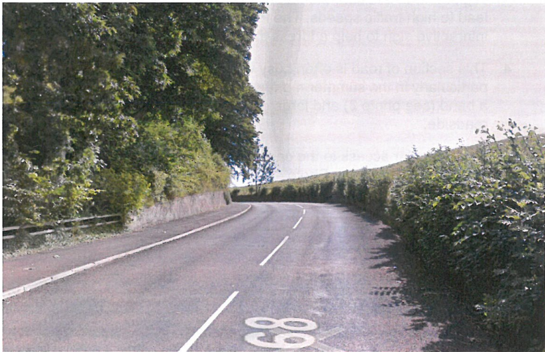
Photo 3. Left hand bend after the castle pedestrian access.