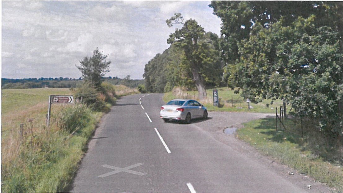
Photo 4. Vehicle access to Norham Castle with bend and blind summit beyond.