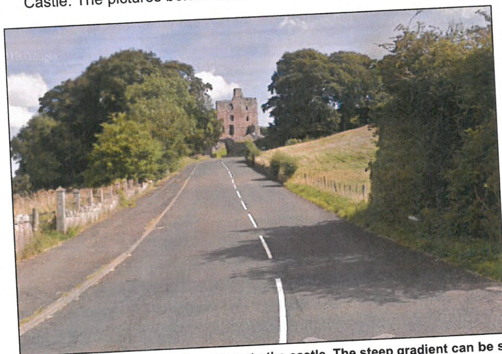
Photo 1. Looking east from the village to the castle. The steep gradient can be seen.