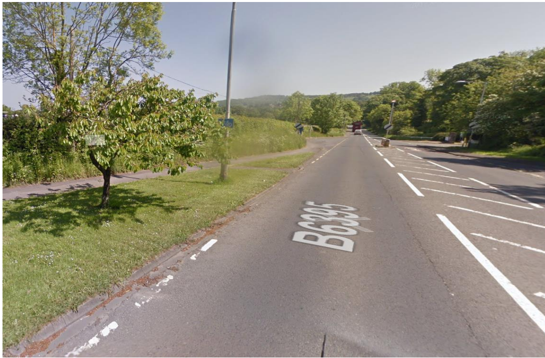
B6395 Eastbound approaching current 30/Deregulated Speed Limit

Concerns of speeding traffic along this section of the B6395 Prudhoe have been raised by residents via local forums on a number of occasions.