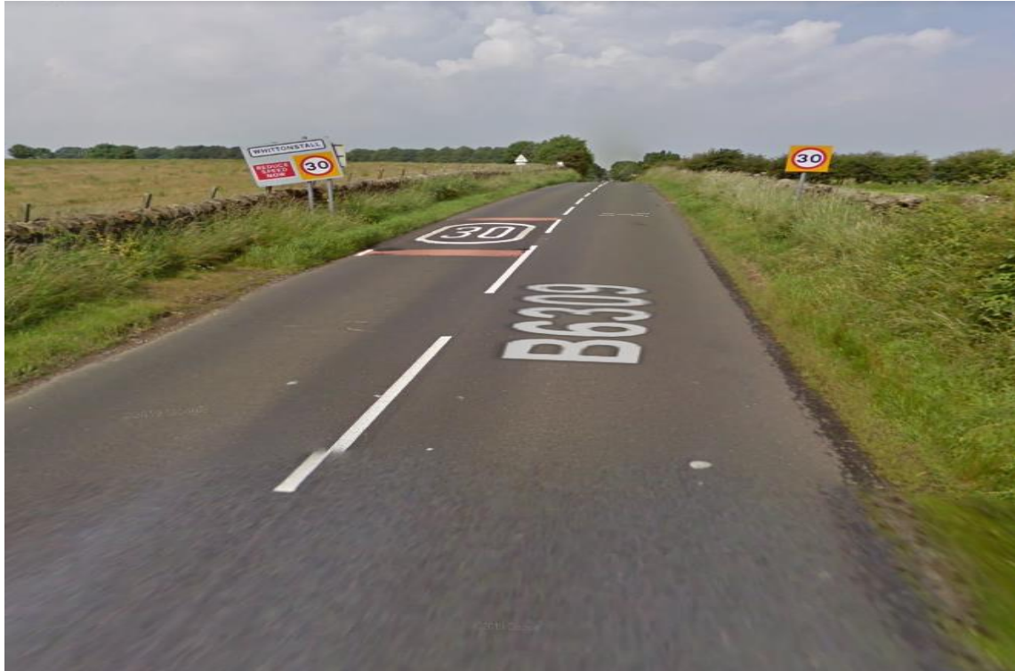
Whittonstall Village northbound approaching existing 30 MPH Limit.

It should be noted that a permanent reduction of the speed limit to 20 MPH adjacent to Whittonstall First School would not be appropriate in these circumstances. However, the installation of an interactive sign indicating 20/30 MPH speed limits is considered a more than an effective alternative.