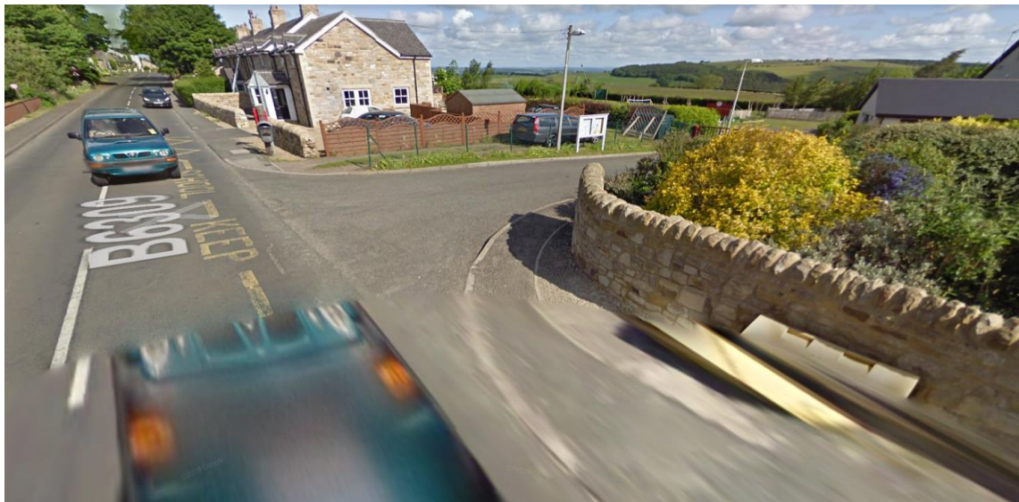
Whittonstall Village northbound approaching Whittonstall First School on the right.