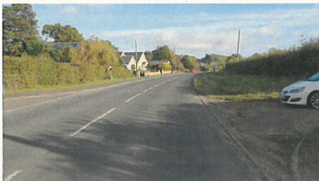
Photograph 1: B6345 showing northbound approach at West Thirston with nearby field and residential accesses

Existing traffic signing and road markings are limited to centre lines, intermittent 'slow' markings, hazard warning signs relating to a sharp bend on the road and 'Welcome To West Thirston' nameplate signs.