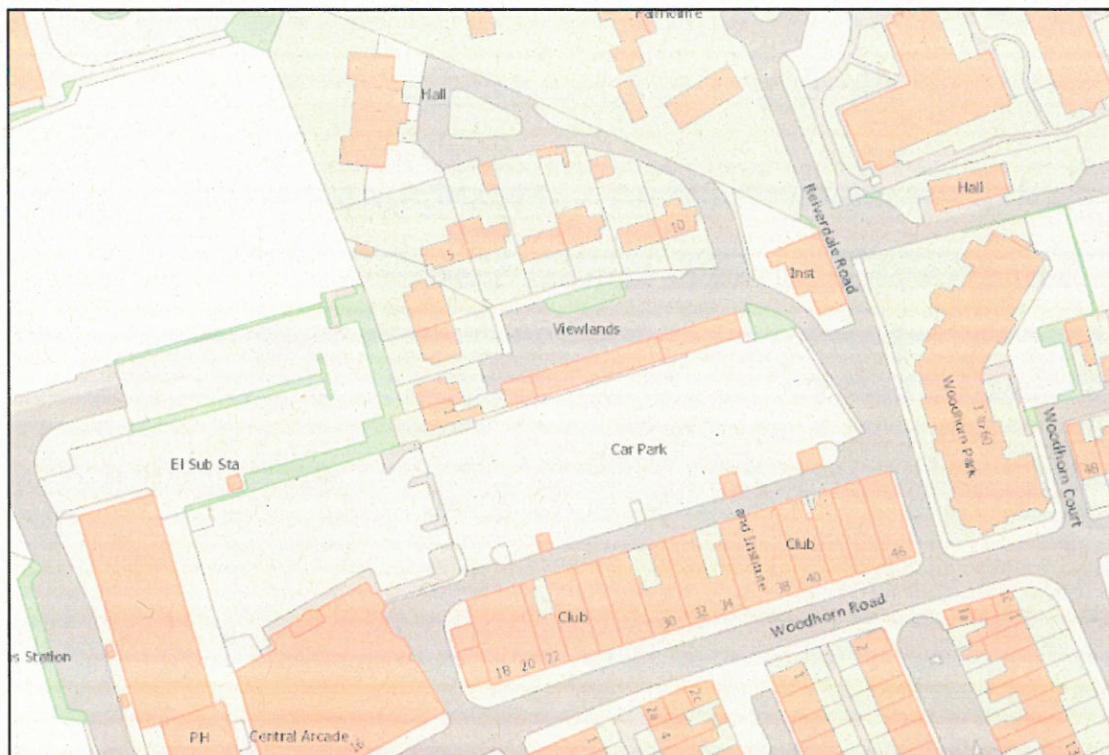
Fig.1. Location Plan