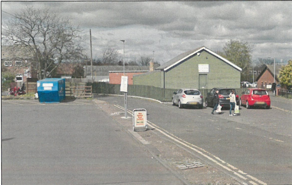
Figure 2: View looking north towards Viewlands from the car park.