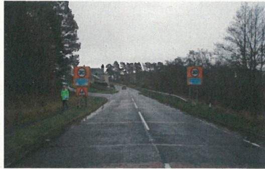
Photograph 1: North-westbound approach to the A68 Rochester showing existing signing and markings