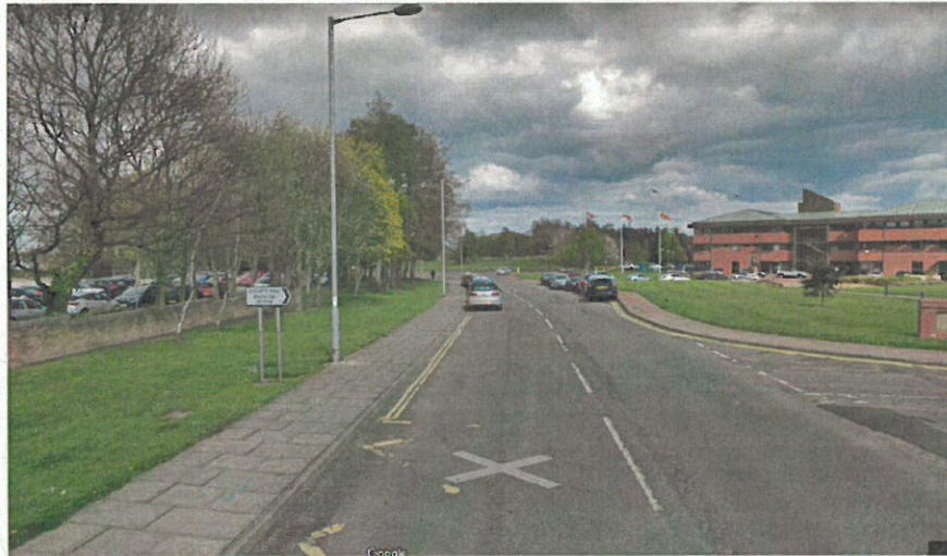
Photograph 1: U6107 County Hall Access Road existing restrictions with some unrestricted parking