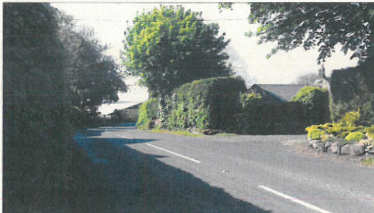
Photograph 1: Existing access with poor visibility where collision occurred

Visibility is poor due to the near 90 degree bend on the entry to Little Bavington from the south side and entry from the north having an approach just over the crest of a hill. One recorded accident occurred in 2017 due to the limited visibility from the access of 'The Cottage', however residents state that near misses are a regular occurrence.