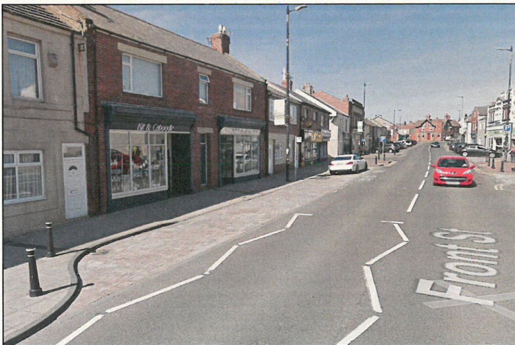
Fig.2. View looking north showing the layby and loading bay.