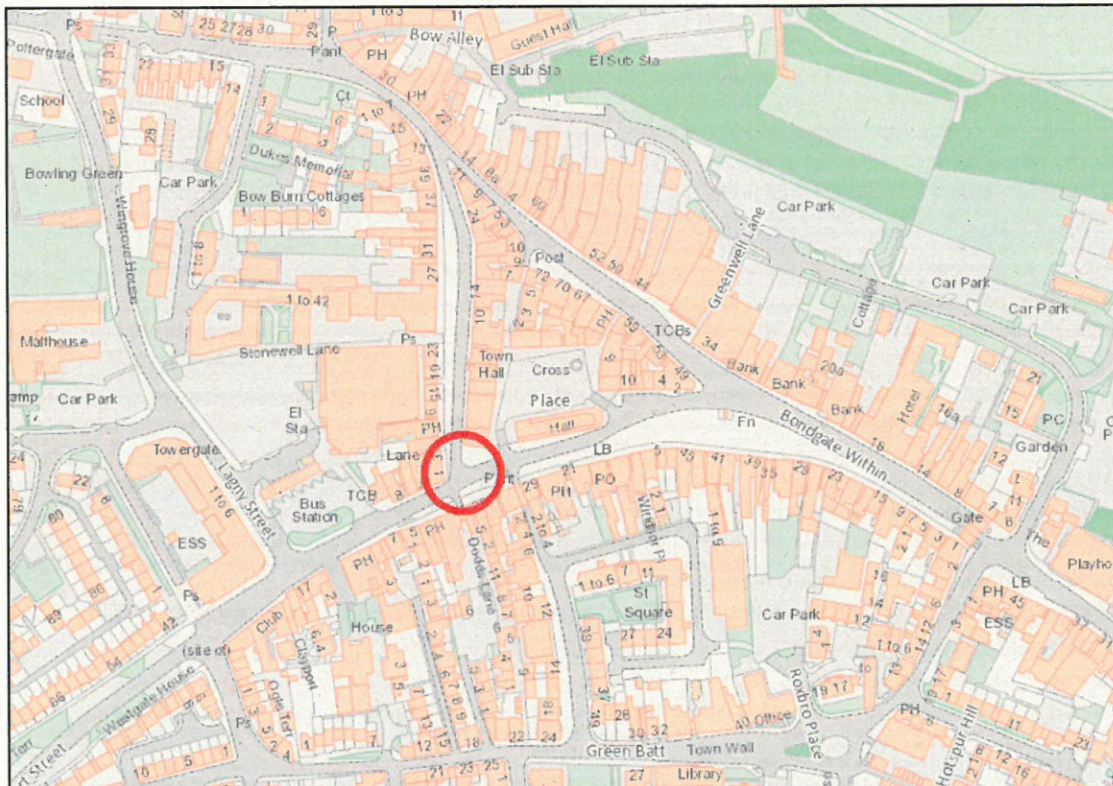
Fig.1. Fenkle St/Market St Junction Location Plan.