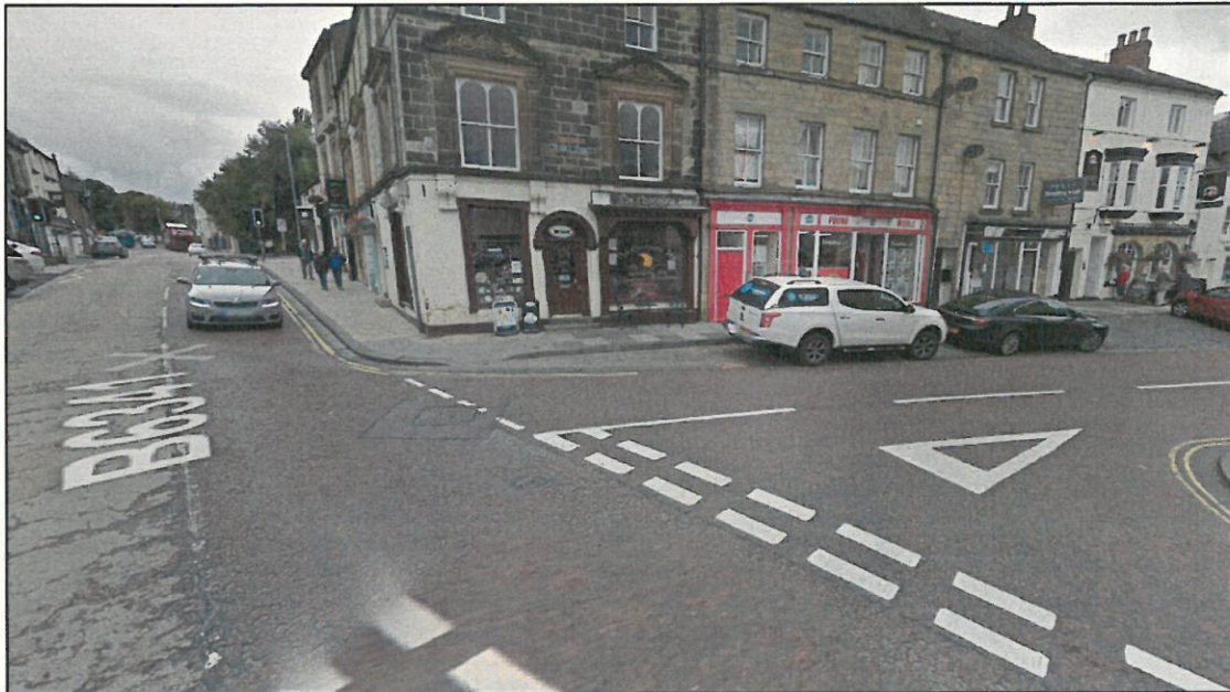
Fig.2. View looking west showing the junction and parked cars.