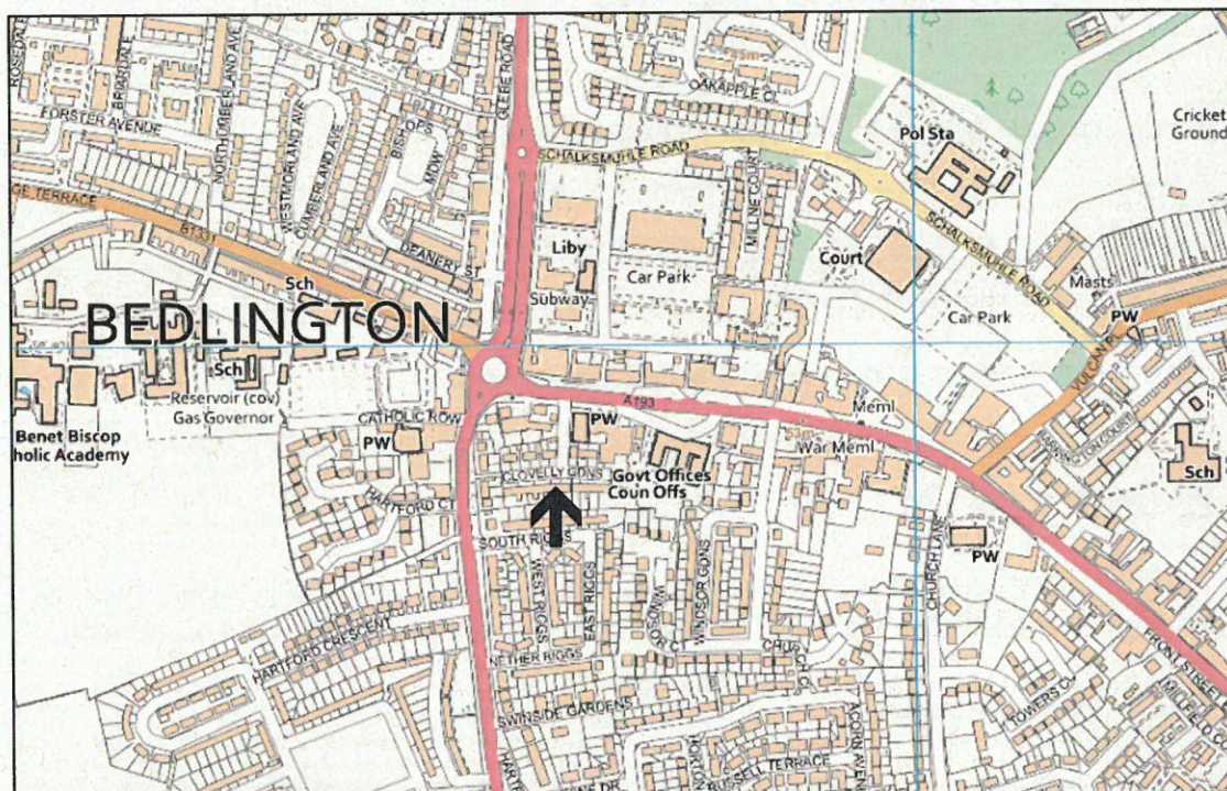
Fig.1. Clovelly Gardens Location Plan.