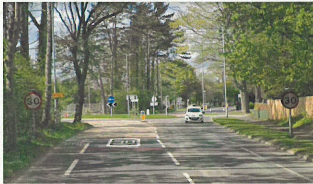
Photograph 1: A197 Northbound approach existing speed limit location

To facilitate access to Collingwood Manor and neighbouring shopping facilities, a compact roundabout was introduced as the most appropriate means of managing traffic movements. The speed limit change from 50 MPH to 30 MPH when travelling in a northbound direction is currently signed immediately in advance of the roundabout. This is signified by illuminated terminal signs supported by road marking roundels.