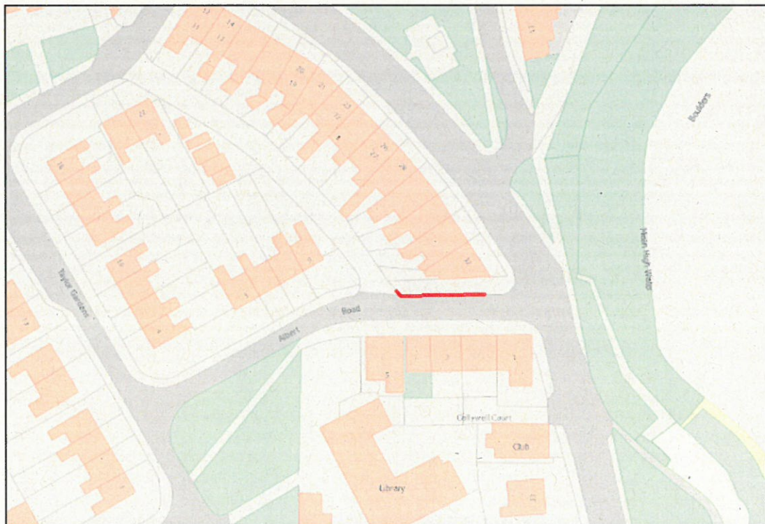
Proposed Double Yellow Lines Extension, Albert Road, Seaton Sluice