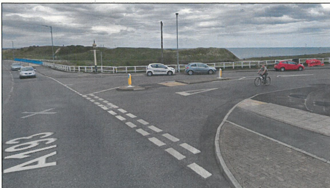
Fig.1. A193 Beresford Road/Collywell Bay Road junction showing the cycle track.