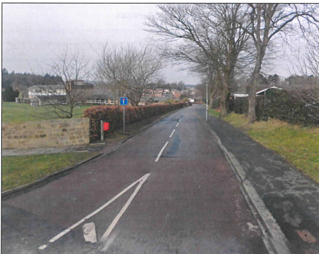
Fig. 1. Hillcrest looking north from the Oaks roundabout.