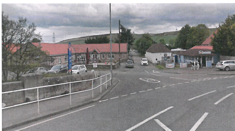
Photograph 1: South Road junction with Brewery Road showing proposed location of restrictions

The popularity of local businesses on Brewery Road has led to an increase in the level of parking. A balance is therefore sought to maintain parking where it is deemed appropriate, whilst also protecting junction visibility and facilitating the safe passage of vehicles along the route. Displacement of vehicular parking is likely to be minimal and availability of parking will be maintained using existing off street provision (see Photograph 1 ).