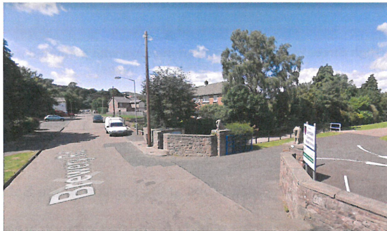
Photograph 2: Glendale Middle School showing proposed area for 'School Keep Clear' markings on Brewery Road (Google street view image)

'School Keep Clear' markings are commonplace outside the majority of schools. Their purpose is to prevent parking or stopping in an area where pupils access and egress the school. They effectively reduce or eliminate the conflict that could arise between moving traffic and Vulnerable Road Users (VRU's). It is understood that pupils enter and exit the school via a footpath which leads to a narrow footway on Brewery Road. This area would benefit from remaining clear from parked vehicles so that a visible presence of pupils is maintained for traffic travelling in both directions (see Photograph 2 ).