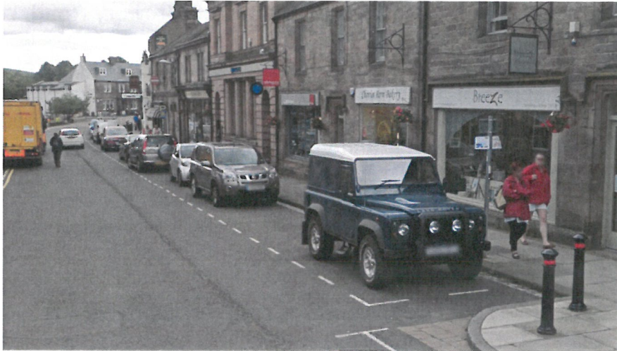
Photograph 3: High Street Wooler, existing parking bays with permitted parking for 45 minutes