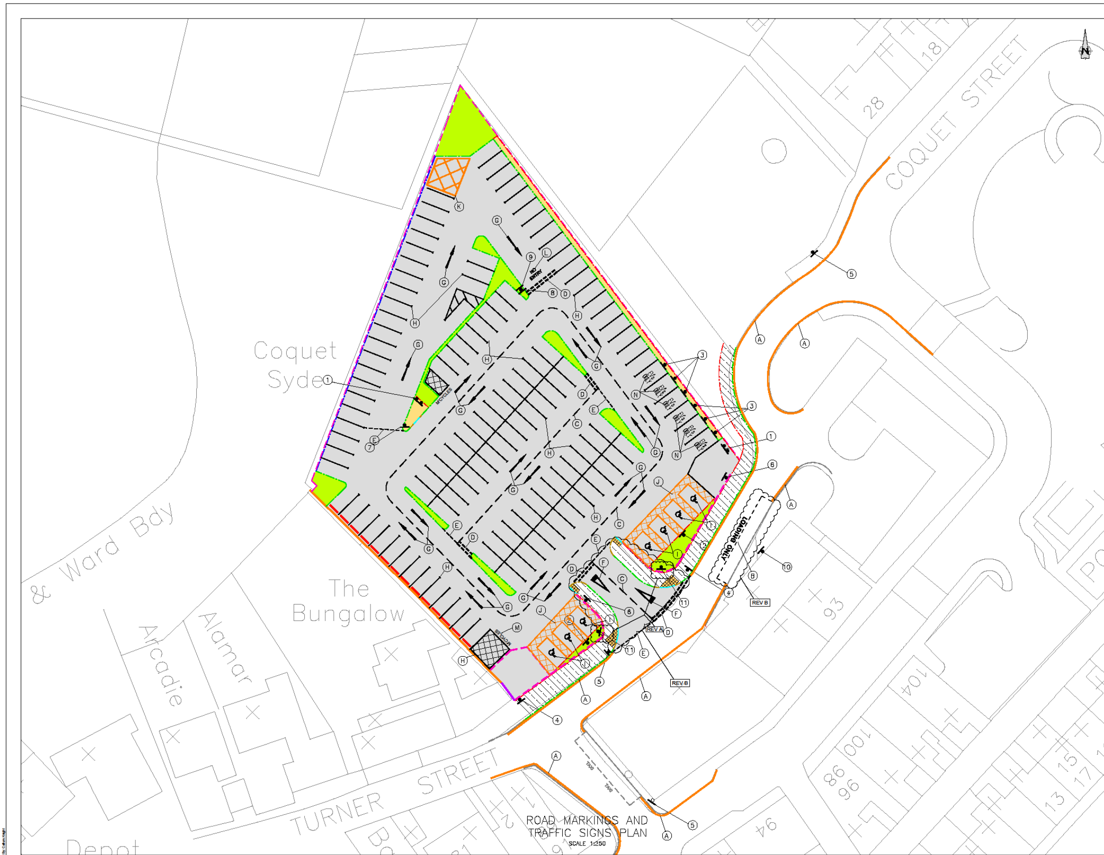
ROAD MARKINGS AND TRAFFIC SIGNS PLAN SCALE 1:250