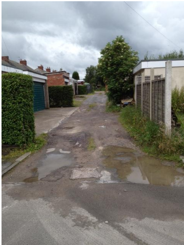
Plate 1 – The unadopted road that contributed to the flooding of Lintonburn Park