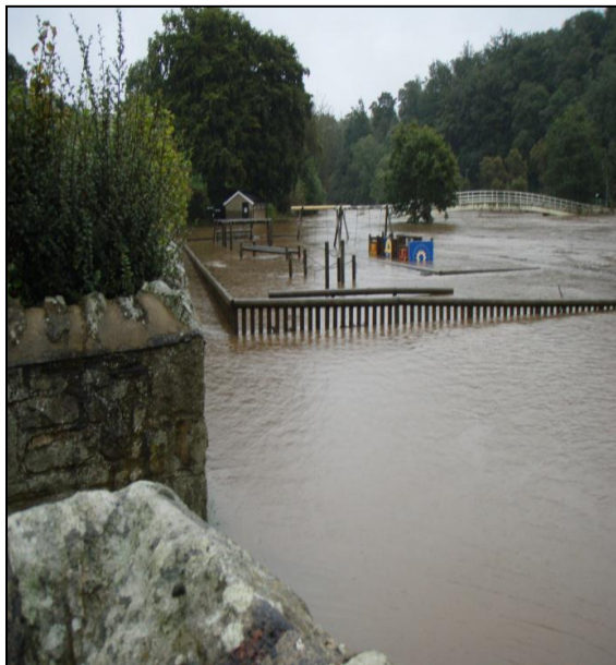
Flooding at Rothbury Playground.