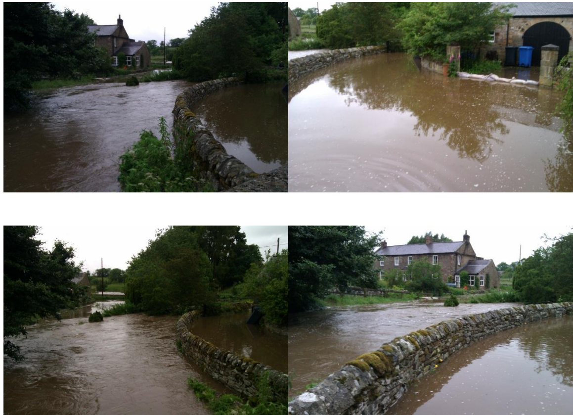
Photos taken by local residents 28/06/2012 - Middleton Burn looking upstream from culvert