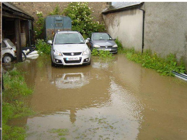
Photos of flooding in Chathill on 28 June 2012