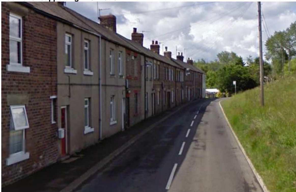
Plate 1 – View looking westwards down Morrison Terrace