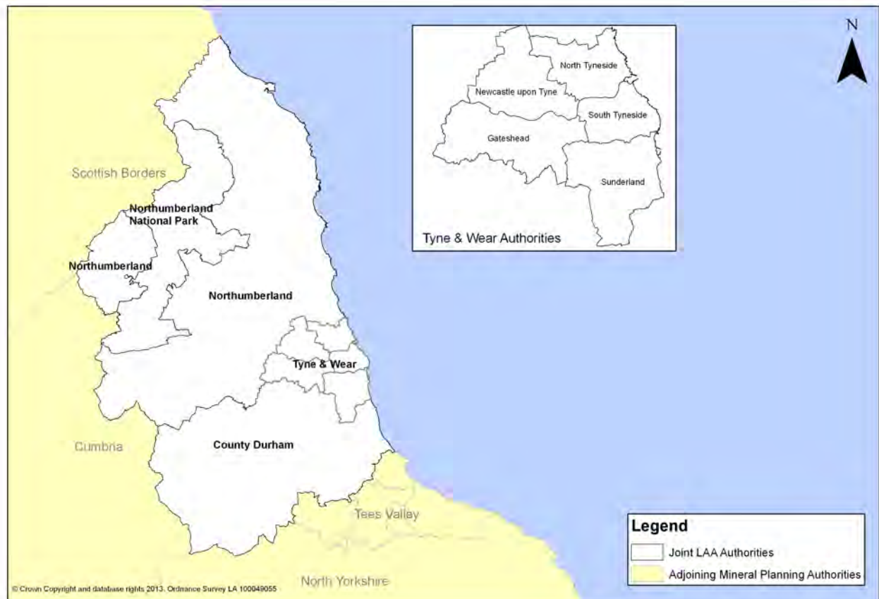
Map 1 Joint Local Aggregate Assessment Area - County Durham, Northumberland and Tyne and Wear

2.8 The mineral planning authorities have sought to work together in the preparation of this joint LAA as part of their ongoing commitment to work collaboratively on cross boundary minerals planning issues and in order to satisfy the 'Duty to Cooperate' (ii) as set out in Section 110 of the Localism Act.