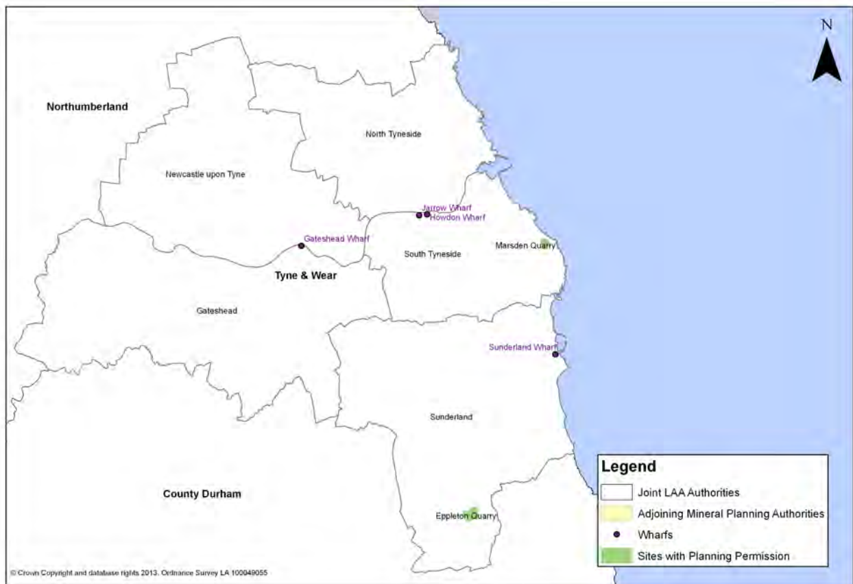
Map 4 Mineral Permissions and location of wharfs in Tyne and Wear

The geology of Tyne and Wear can be seen on the Mineral Resource Map for Northumberland and Tyne and Wear which was produced by the British Geological Survey which can be downloaded here: http://www.bgs.ac.uk/downloads/start.cfm?id=2578