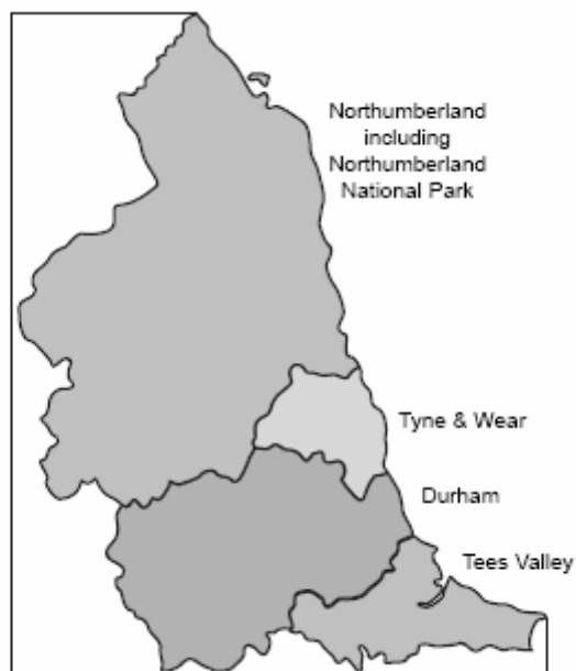
Figure 1.1: North East England