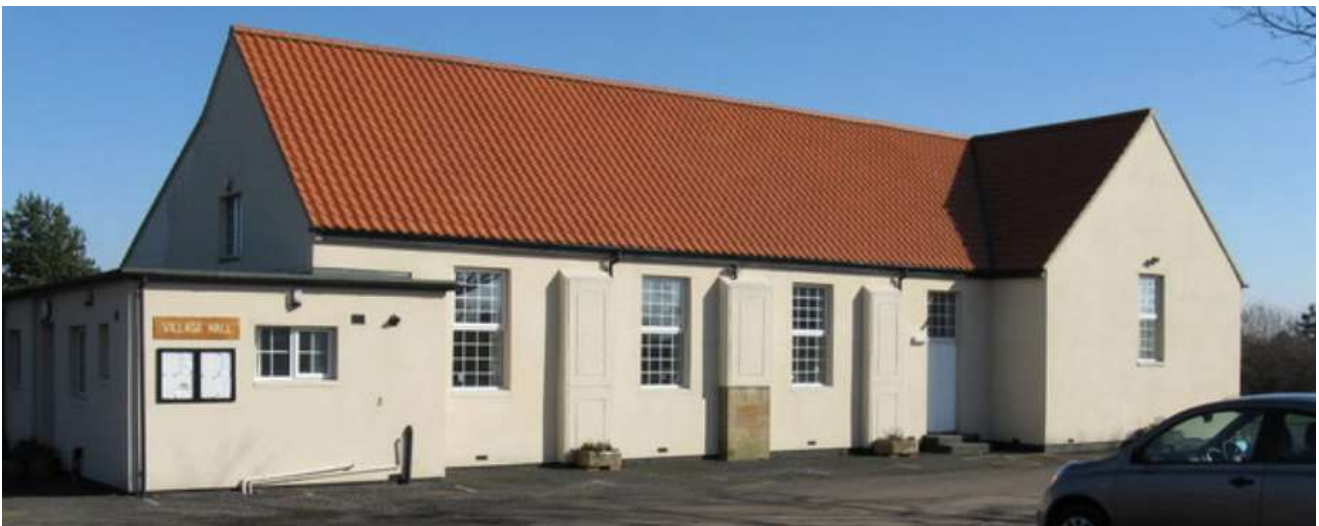
Photo 1: Stannington Village Hall - a much valued Community Facility

A community action is proposed to list Assets of Community Value (ACVs) under the 'Right to Bid' legislation contained in the Localism Act 2011. It is expected that the ACVs proposed by the Parish Council will be registered where they meet the criteria set out in the relevant Regulations. A list of all community actions is contained in Part 6 of the Plan. As part of this community action, the Parish Council propose to undertake further consultation to establish which community assets to propose as Assets of Community Value. Once this consultation has been conducted, and Community Assets have been registered, then Policy 1 will be applied to any proposals involving the loss of a registered ACV.