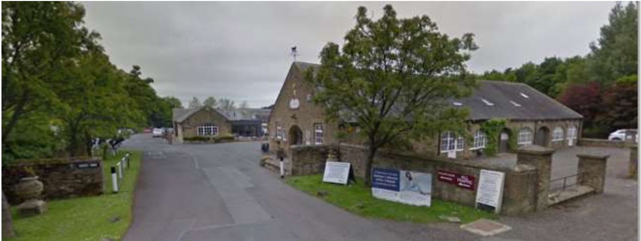
Photo 3: The Milkhope Centre, one of a number of 'rural business centres' in the Parish