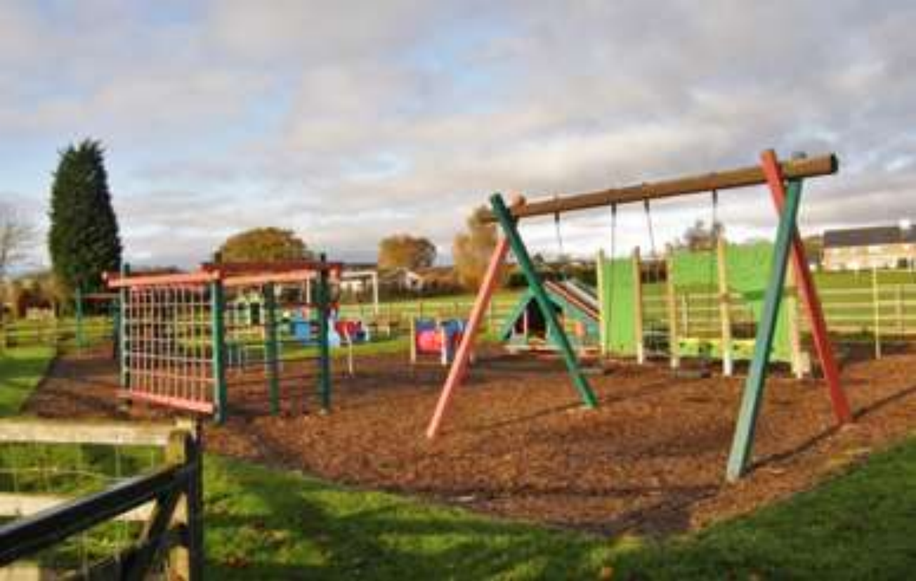
Photo 2: Stannington Playing Fields and play area - designated as Local Green Space