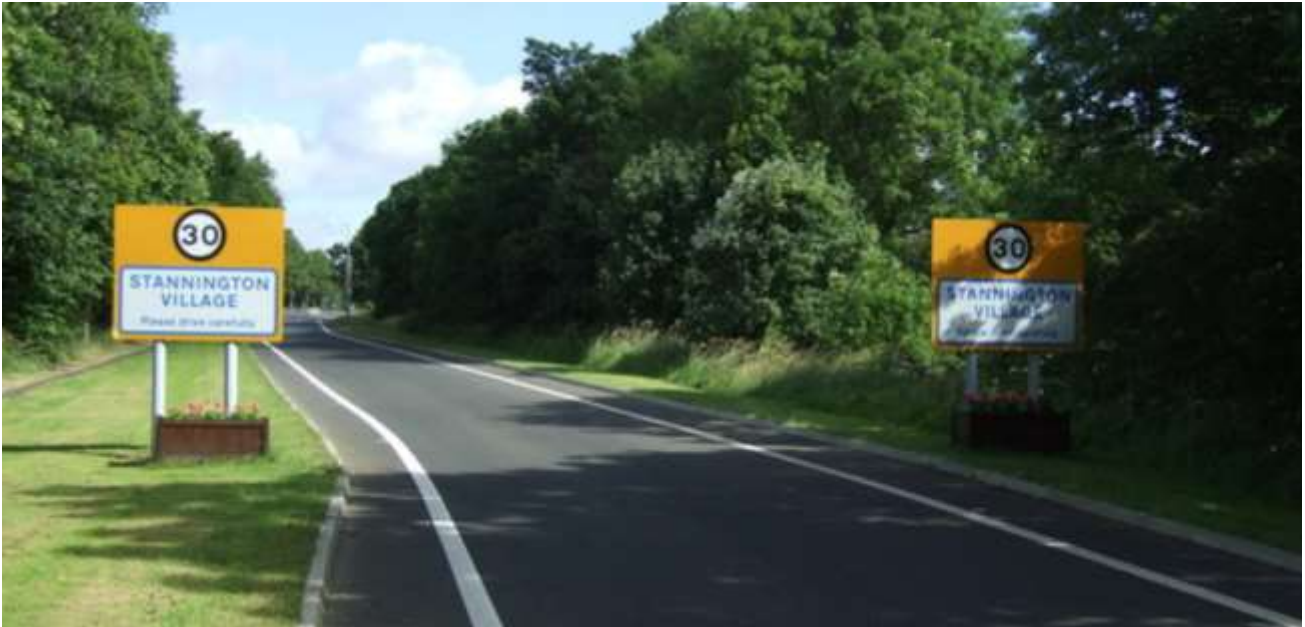
Photo 4: Entrance to Stannington Village - traffic speed is key issue in Stannington and Stannington Station

Objective 4: ‘Reduce the detrimental effect that road traffic has on residents and businesses in the Plan area, whilst seeking improvements to local highway networks, including pedestrian and cycle routes, and public transport provision’.