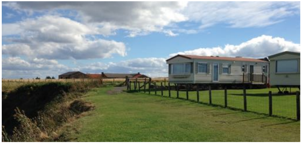
Photo 3: Caravan park in Seahouses - fenceline forms settlement boundary. Sewage works visible in background - field excluded

The boundary therefore runs along St. Aidan's Road, Seafield Road, Harbour Road, Crewe Street, and then along the clifftop fence line of the caravan park, before turning inland, following the fence-line of the caravan park.