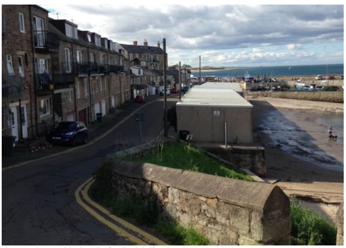
Photo 2: Harbour Road, land to right of road excluded from boundary

All land to the left is excluded. Along most of this stretch there is no development, with the exception of the harbour car park and house (excluded). The settlement boundary follows the Harbour Road down to the Harbour, and continues along Harbour Road, and Crewe Street (below)