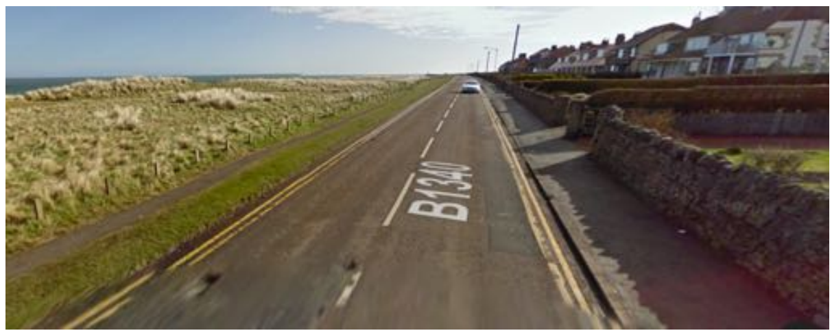
Photo 1: B1340 looking east (St. Aidan's Road). Land to left excluded, land to right

Coastal boundary (north east): The far northern settlement boundary begins at the junction of Broad Road and St. Aidan's road. It runs along St. Aidan's Road, with the cliff-top walk on the left (and outside the settlement boundary).