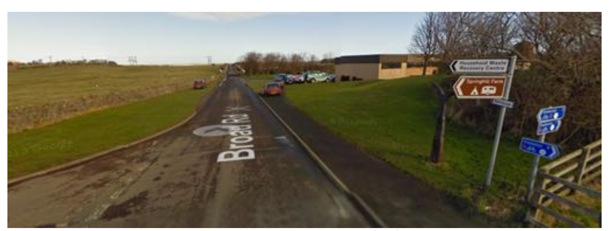
Photo 7: Settlement boundary along Broad Road - all land to right included (east)

The boundary, following existing hedge and fence lines, joins existing housing development (Islestone Drive and Bamburgh View), and closely follows the rear boundary of those properties. It excludes the recycling centre, and then travels up Broad Road (land to the west excluded, land to the east included), until it joins the northernmost boundary at St.Aidan's.