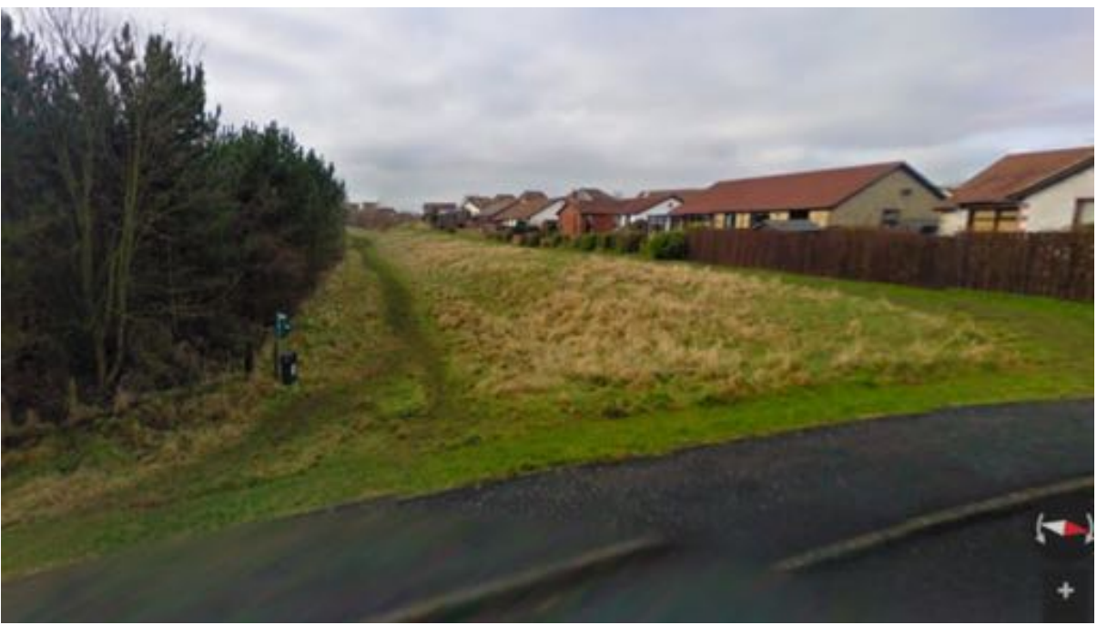
Photo 5: Southernmost point of settlement boundary at entrance to Quarryfields. Line to follow existing development to right of Quarry Walk

Southern Boundary: The southern boundary is also drawn tight along existing built development. It starts at Quarryfields, follows the road, and then the rear gardens of properties along Quarryfields and Staple Court.