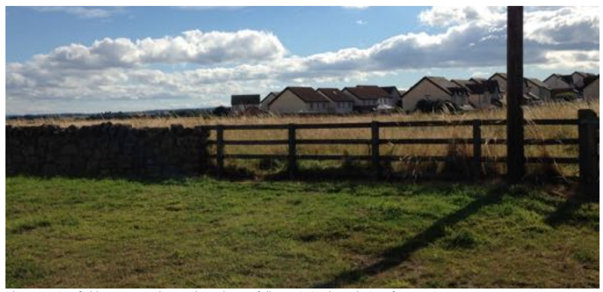
Photo 4: Kingsfield Estate - settlement boundary to follow existing boundaries of properties

The boundary is then drawn tightly following the built development line of the Kingsfield Estate, until it reaches the main road (Kings Street).