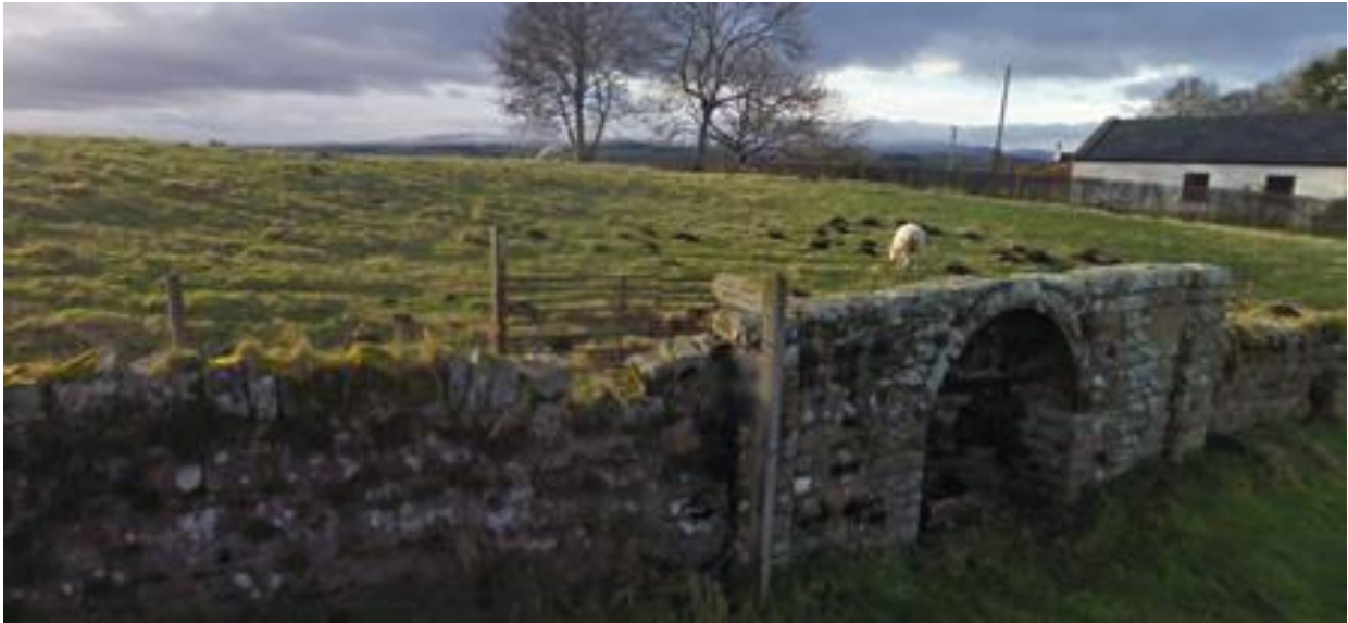
Holburn Local Green Space