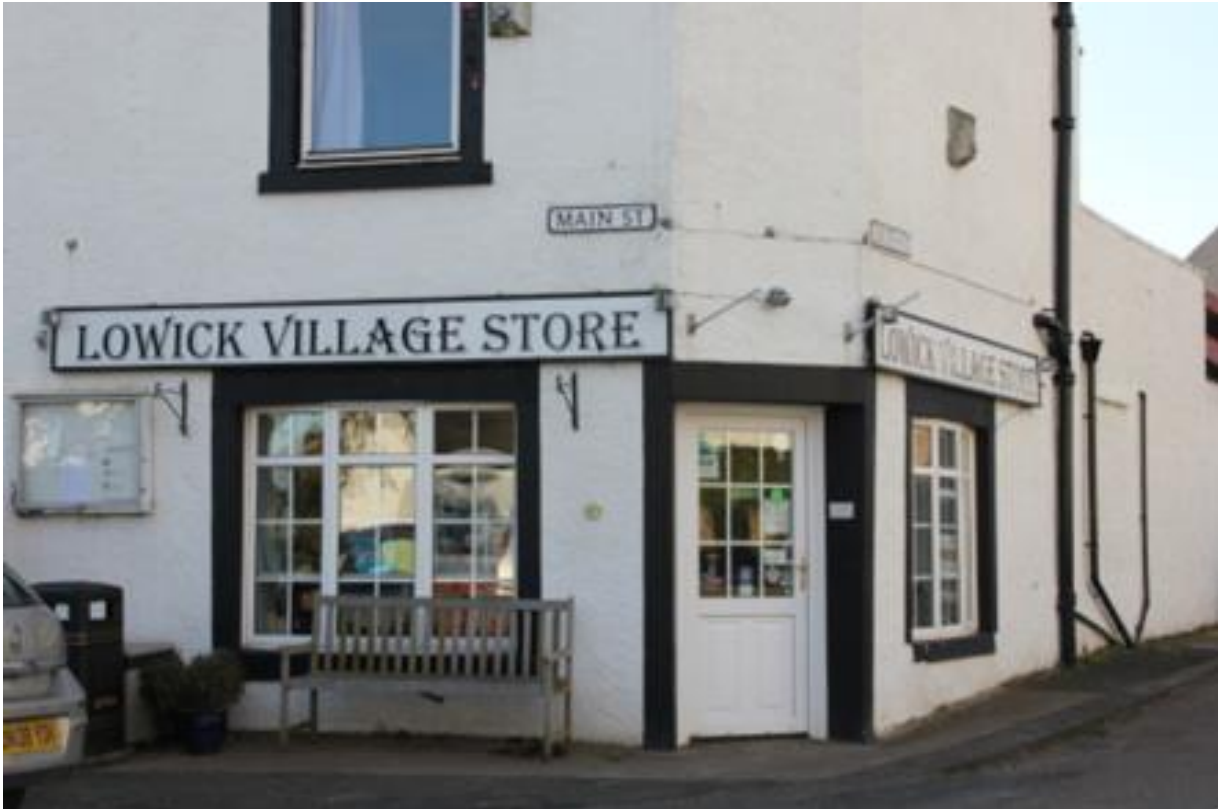
Lowick Village Store - a much valued community facility