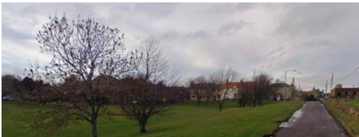
Lowick Common from the approach along South Road