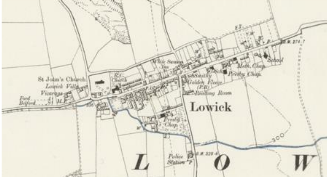
Lowick 1899