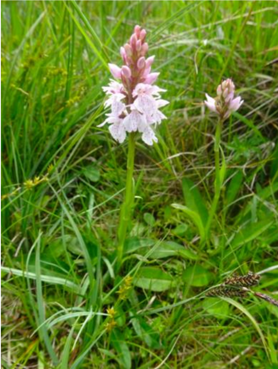
Figure 1: Heath Spotted Orchid (to be found on Catton Ridge)