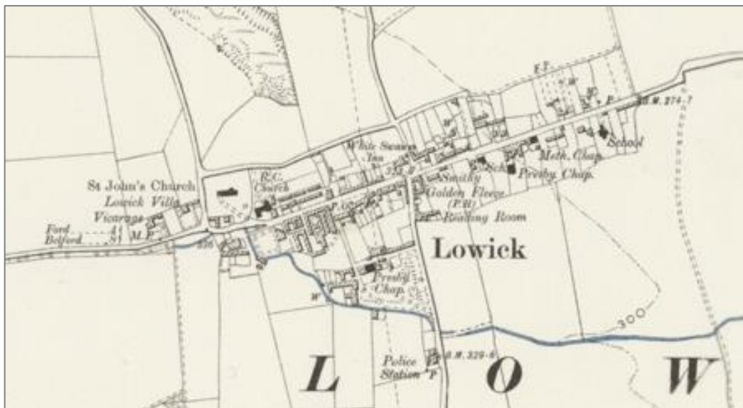
Lowick 1899