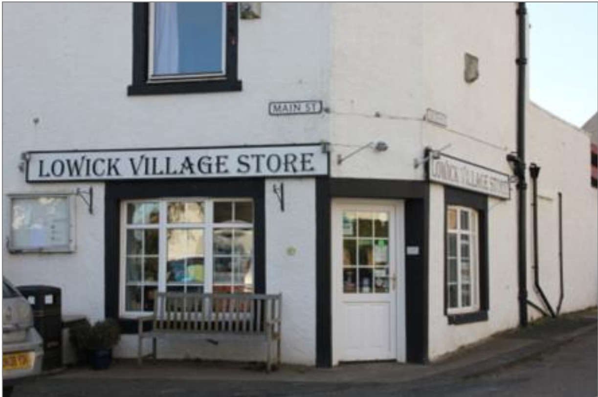
Lowick Village Store - a much valued community facility

Lowick will grow in such a way that respects the special landscapes around it, incorporates biodiversity into new development and respects the special qualities of the area.