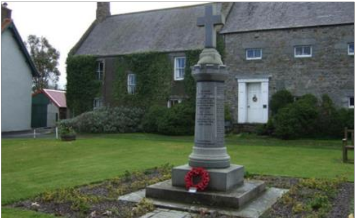
Lowick War Memorial and green