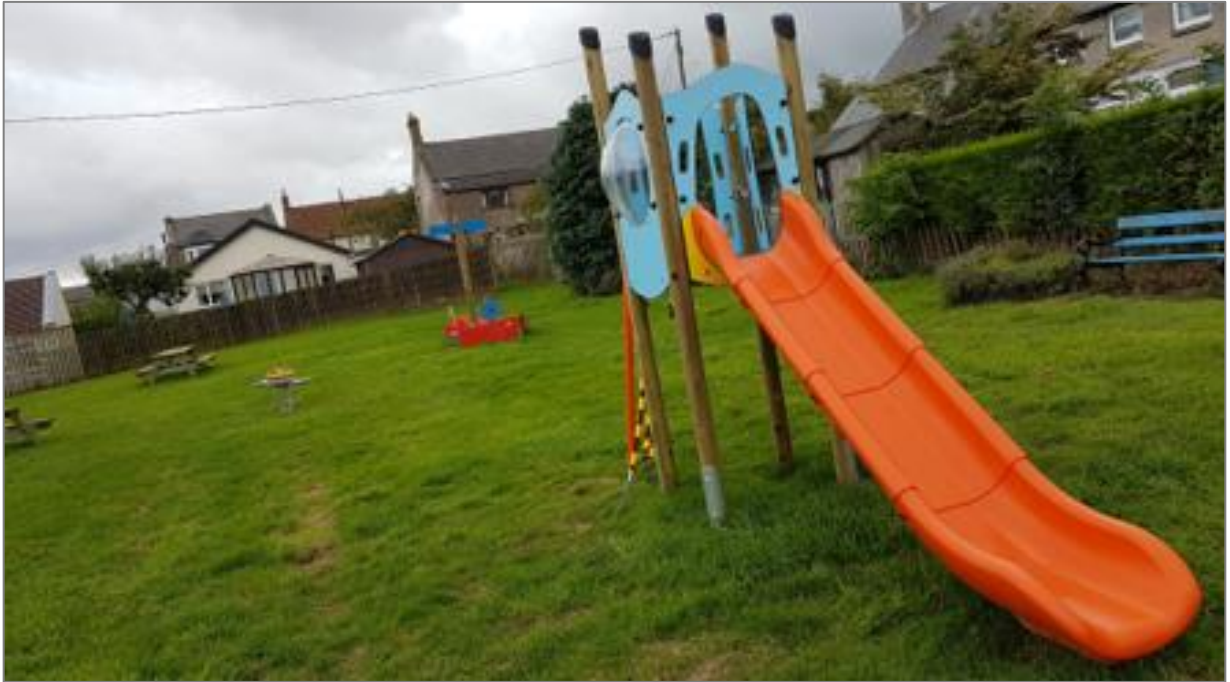
Lowick Play park