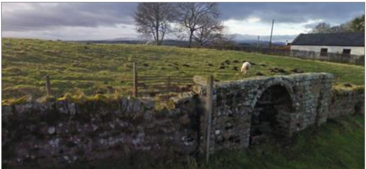
Holburn Local Green Space