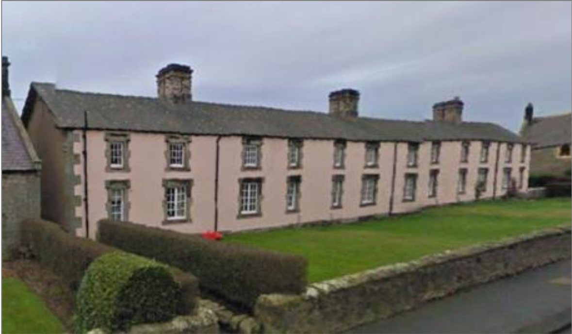
Farm cottages in the centre of Lowick