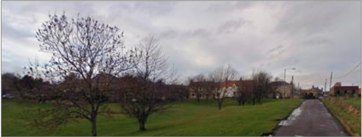
Lowick Common from the approach along South Road