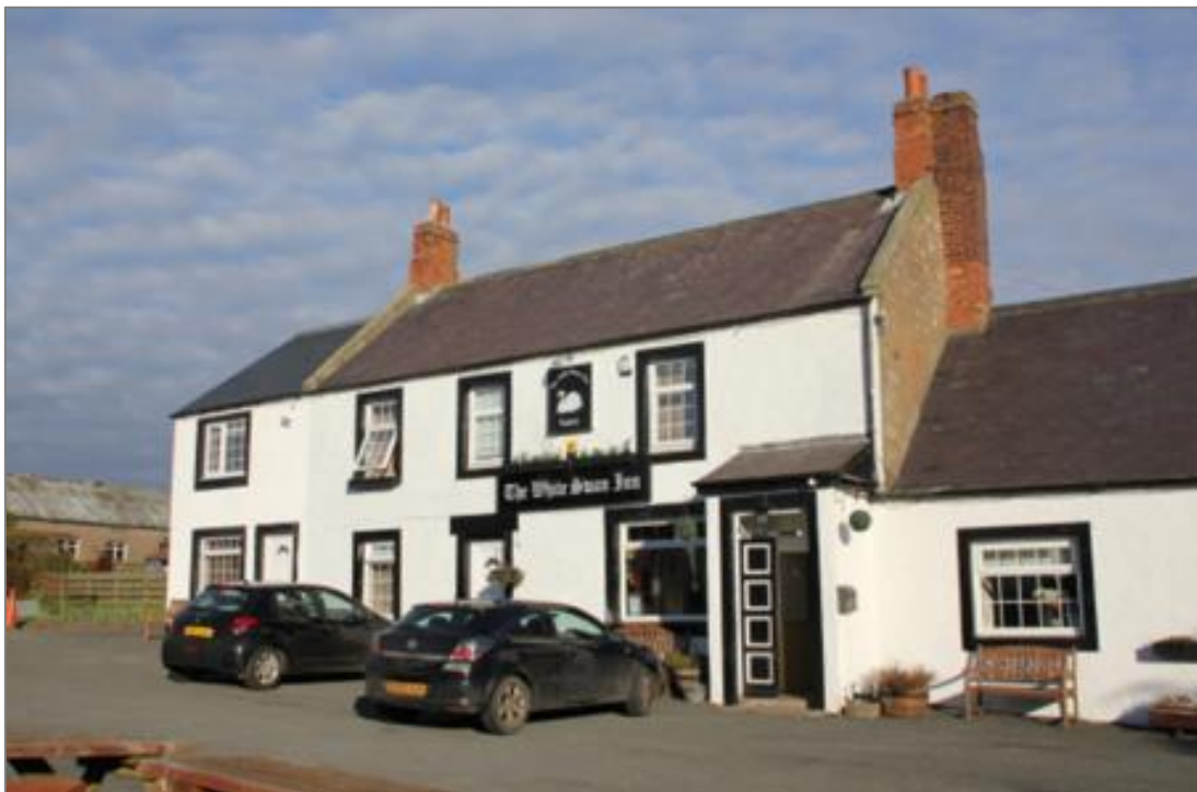
A local pub