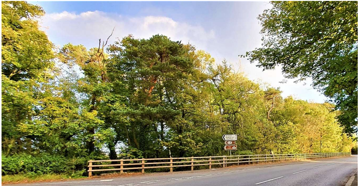
LGS1, from A697, looking east