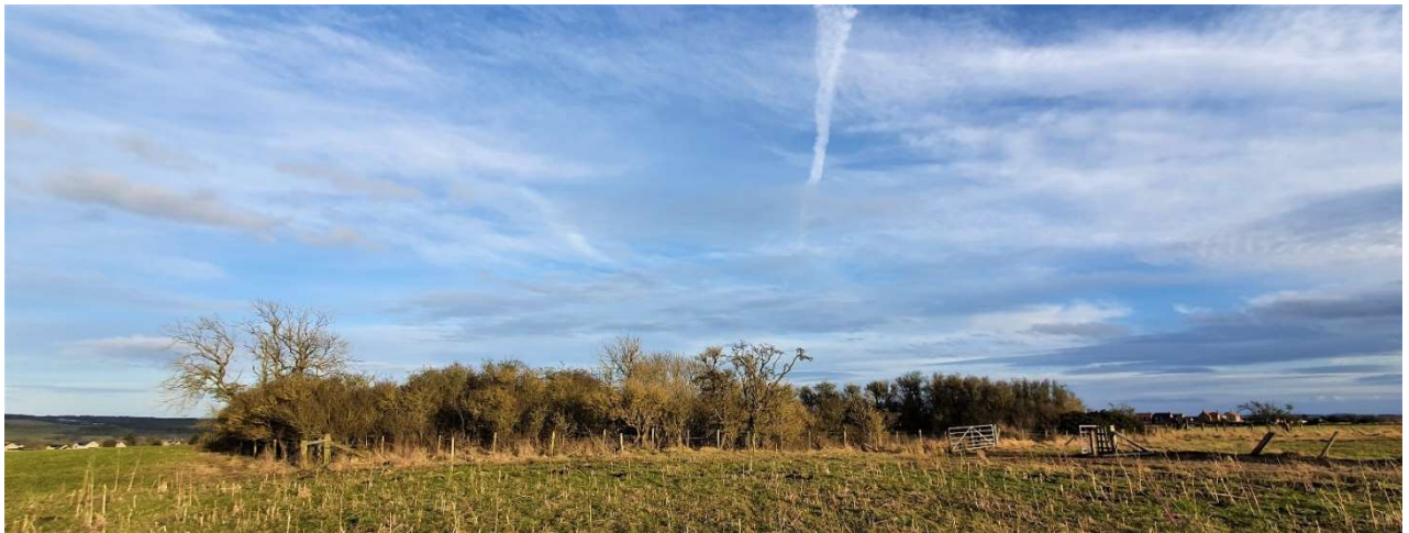
Onstead Quarry, looking east