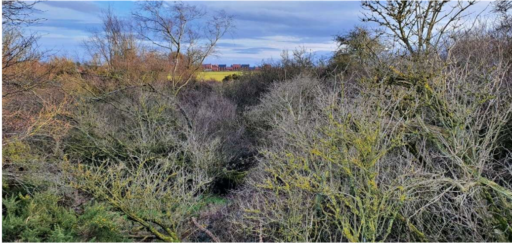
View across Onstead Quarry (in winter) to the south, with Fenwick Park and Armstrong Grove in the background