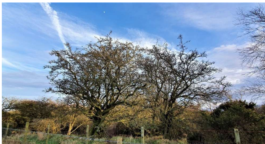
Dense planting of trees and shrubs (in winter)