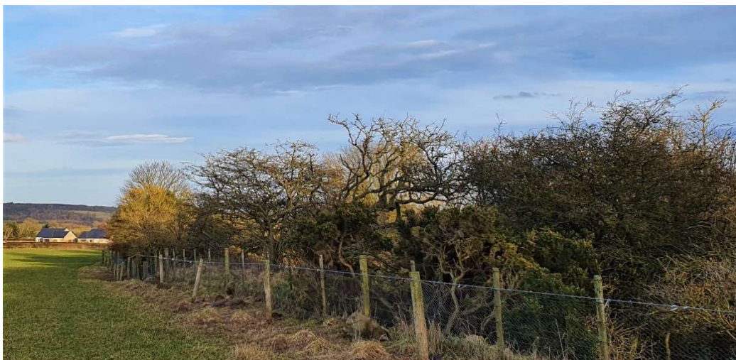
Northern perimeter of quarry, with St Laurence Court visible to the left