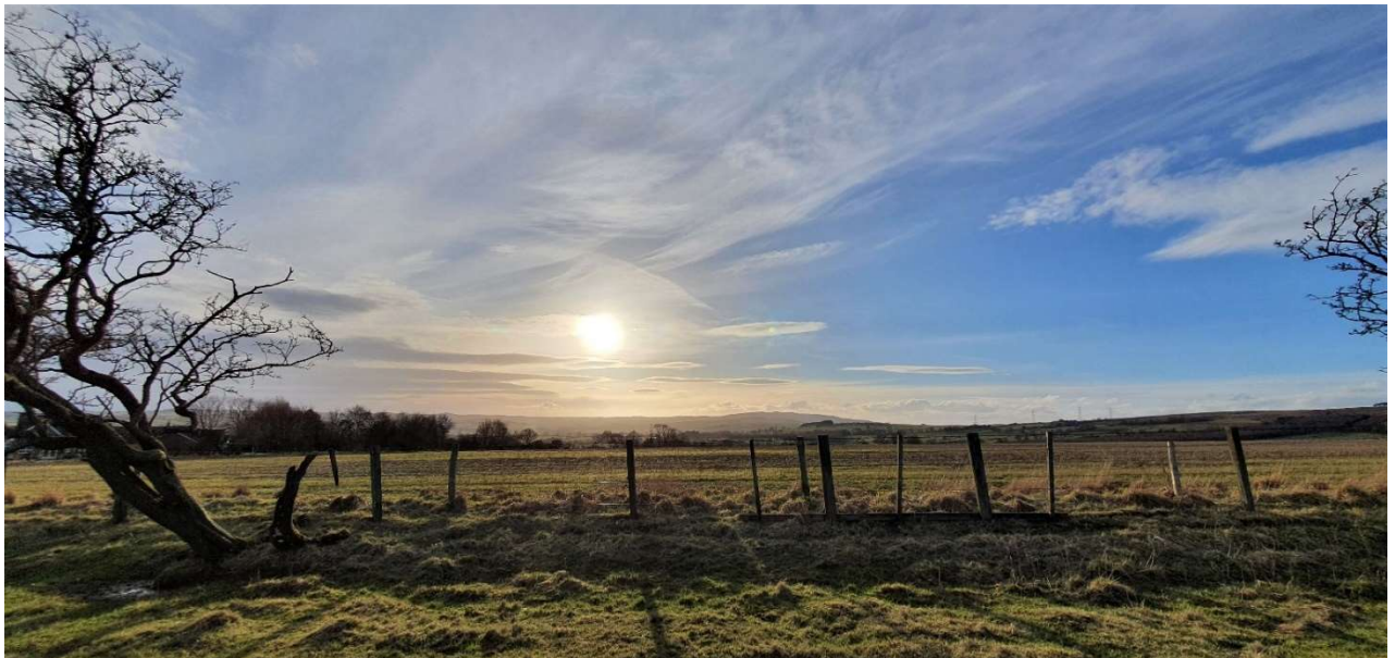
View of Simonside from Onstead Quarry, looking west