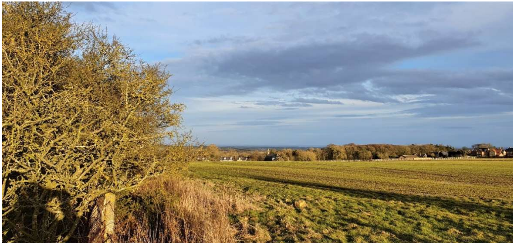
Southern perimeter of quarry, with United Reformed Church, Land North of Fairfields (18/03231/FUL), and Fenwick Park, visible to the right