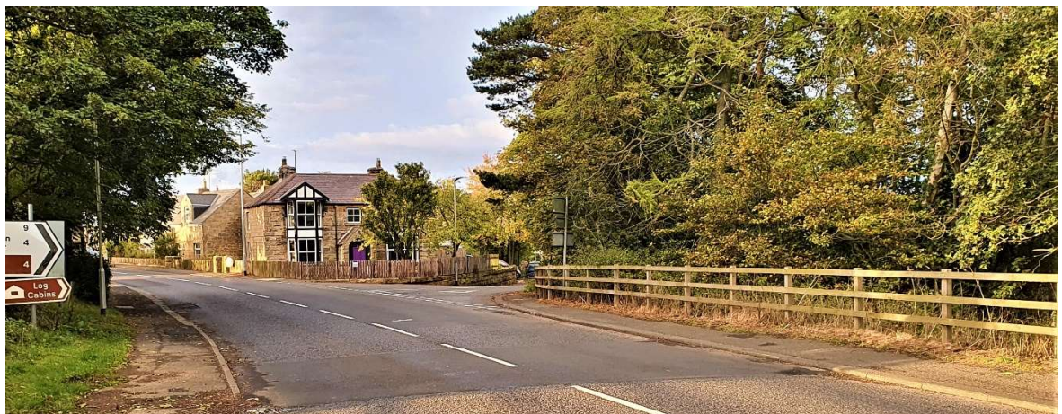
LGS1, from A697, looking north