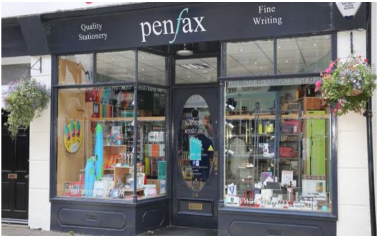
Figure 3: Example of a traditional shop front on Market Street in the Hexham Conservation Area