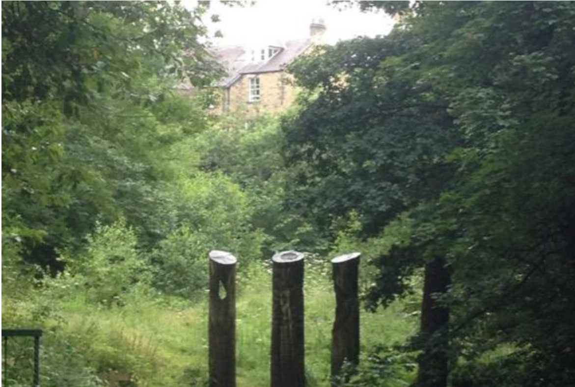
Figure 6: Wildlife corridor along Cockshaw Burn