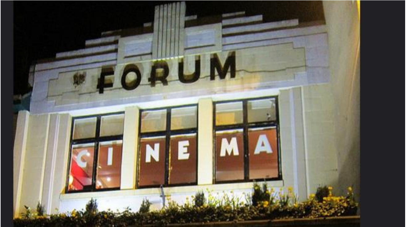
Figure 9: The Forum Cinema - managed by Hexham Community Partnership