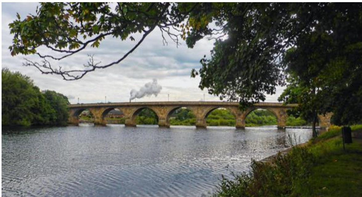
Figure 5: Tyne Green with Hexham Bridge