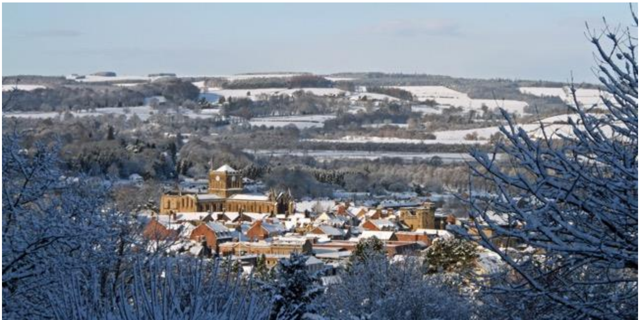
Figure 1: Hexham's dynamic roofscape and Grade I listed buildings and Scheduled Monuments clearly visible from a distance