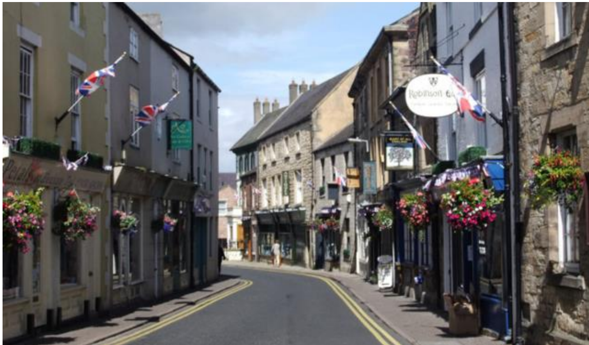
Figure 10: Market Street in Hexham's Conservation Area

Policy HNP25: NEW CAR PARKING FACILITIES