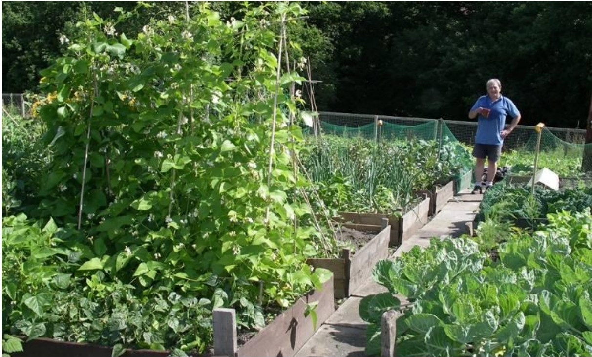
Figure 7: Allotments at Wydon Burn, Hexham