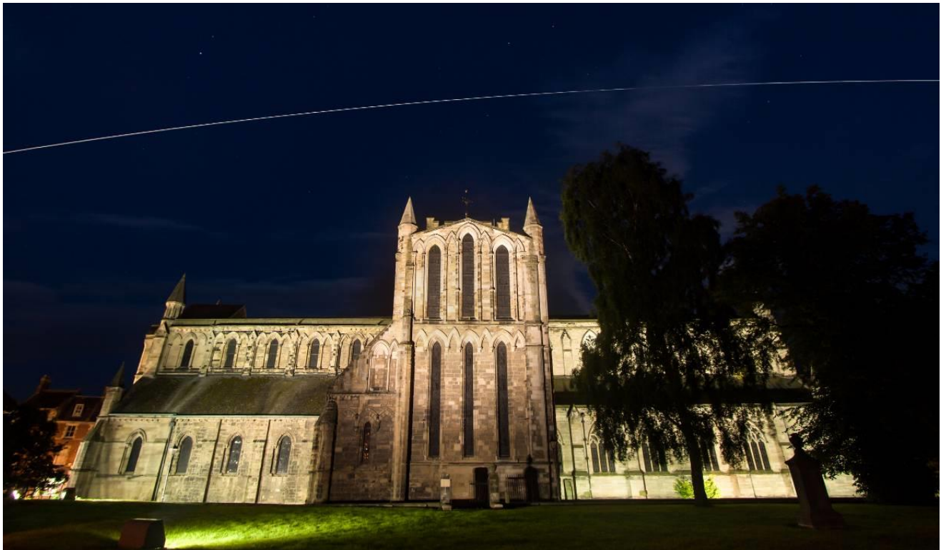
Figure 8: Hexham Abbey at night

Development should respect the dark sky environment of Northumberland National Park.