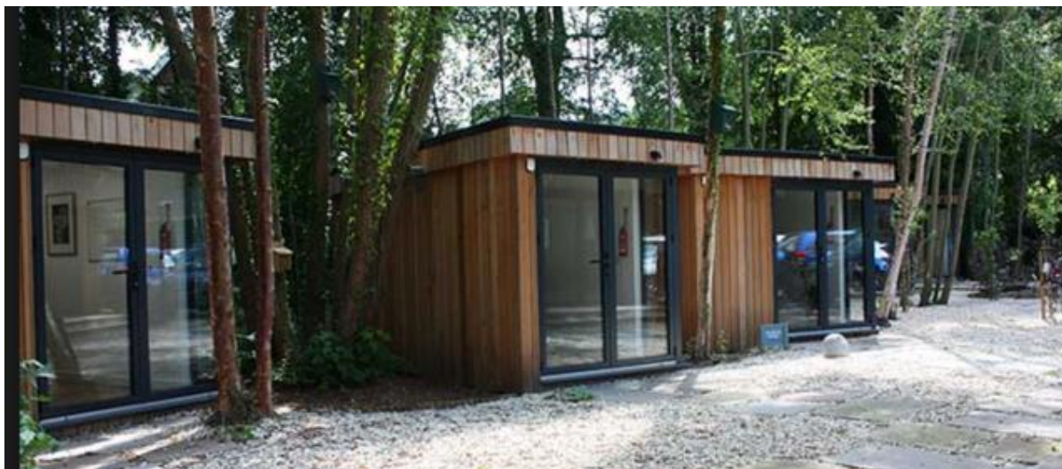
Figure 12: Rural Enterprise Hub at Northumberland National Park Head Office, Hexham