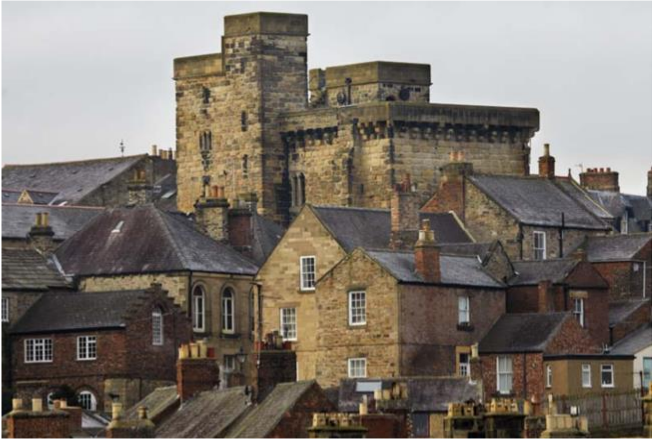
Figure 2: Hexham's roofscape as seen from the Wentworth Car Park