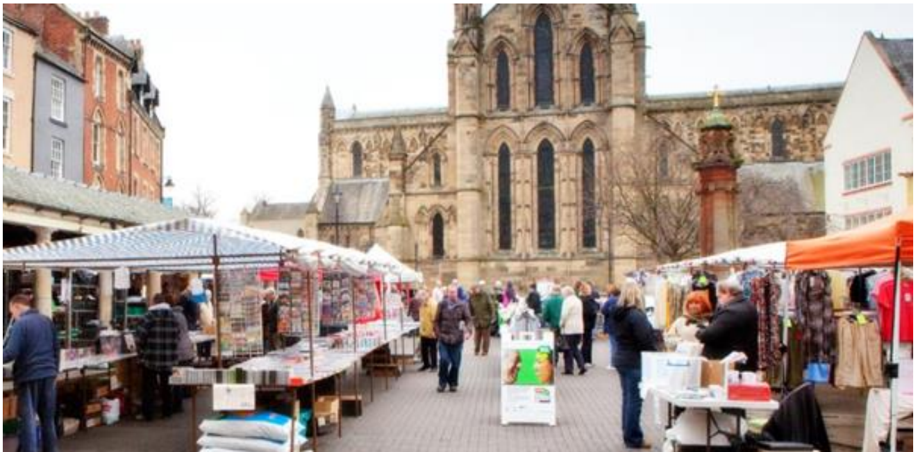
Figure 4: Market Square in Hexham on market day

5.1.24 Contemporary designs are sometimes acceptable if they are of high quality, use traditional scale and proportions, and respect the host building and the street scene. New frontages should represent locally distinctive characteristics in terms of design, scale, massing, height and materials.