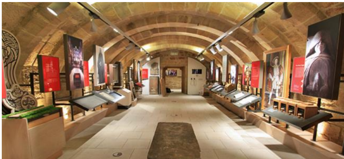
Figure 11: Hexham Abbey Visitor Centre