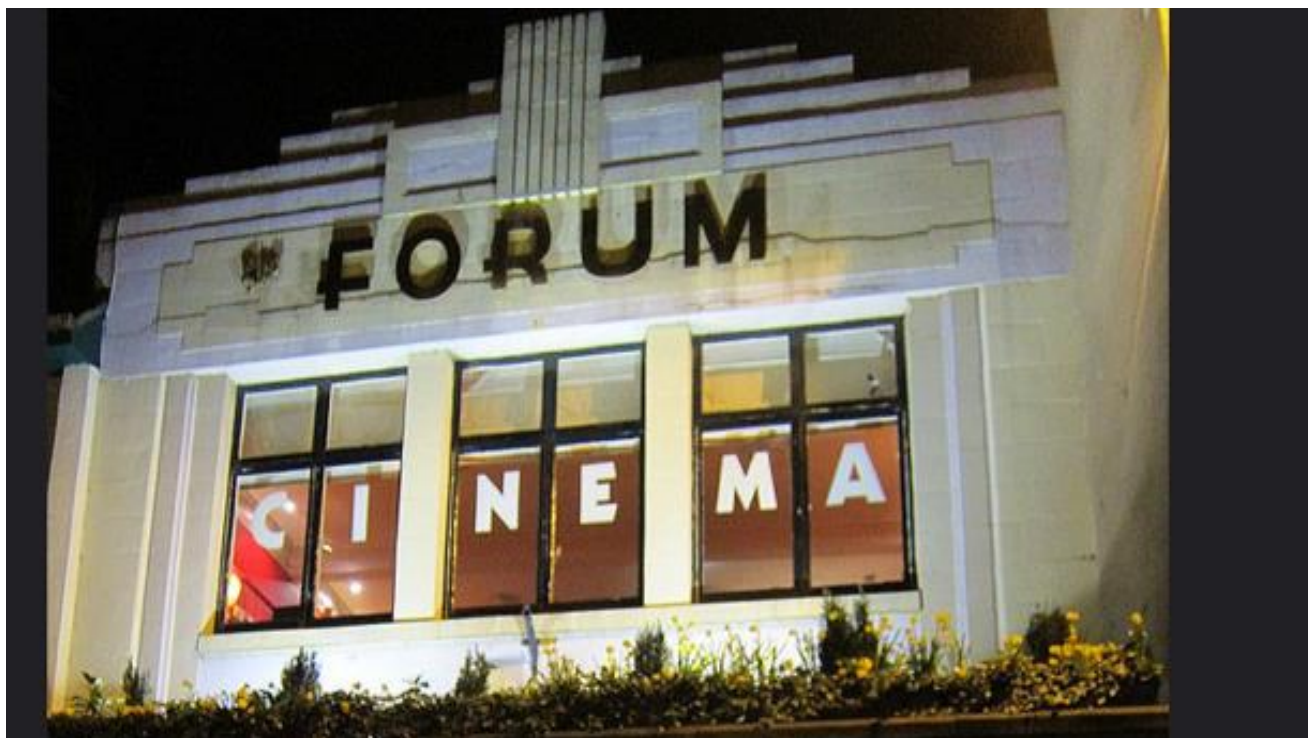
Figure 9: The Forum Cinema - managed by Hexham Community Partnership