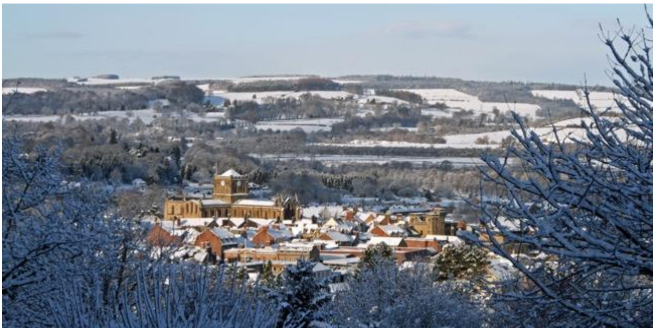
Figure 1: Hexham's dynamic roofscape and Grade I listed buildings and Scheduled Monuments clearly visible from a distance