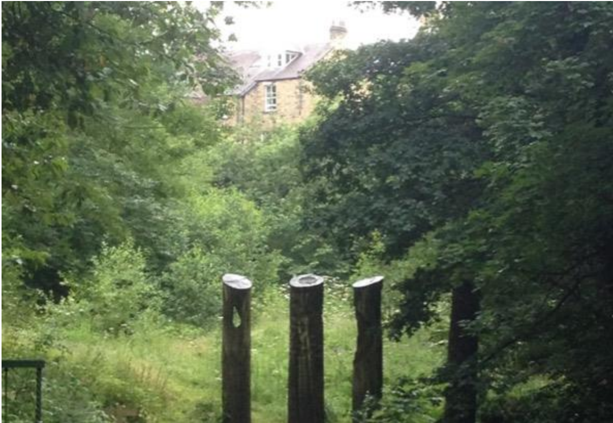
Figure 6: Wildlife corridor along Cockshaw Burn