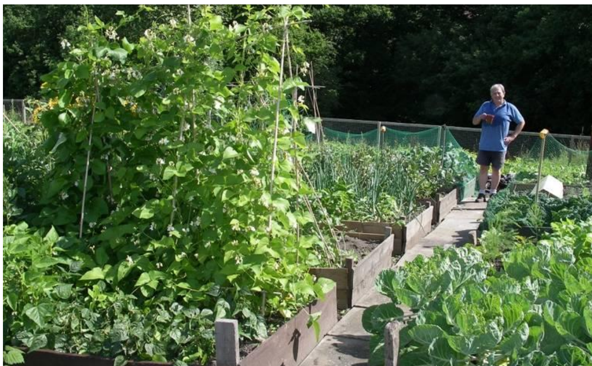
Figure 7: Allotments at Wydon Burn, Hexham