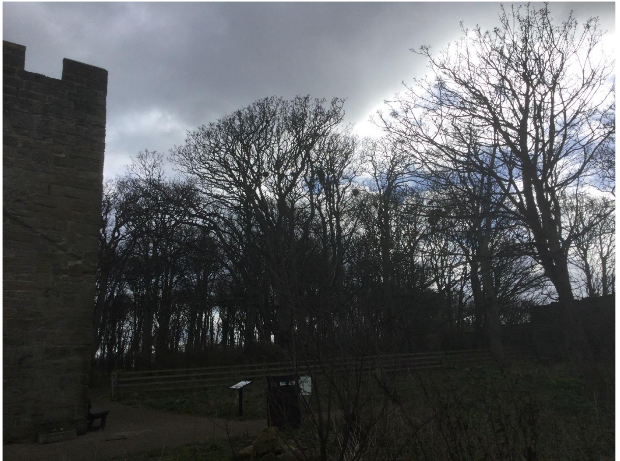
Woods by the Pele Tower

The walled garden of the Pele tower is a kitchen garden of historic significance, has significant recreational value, offers tranquillity and a richness of wildlife. The land immediately around the tower, recently replanted with shrubs and trees, is of similar value to the village.