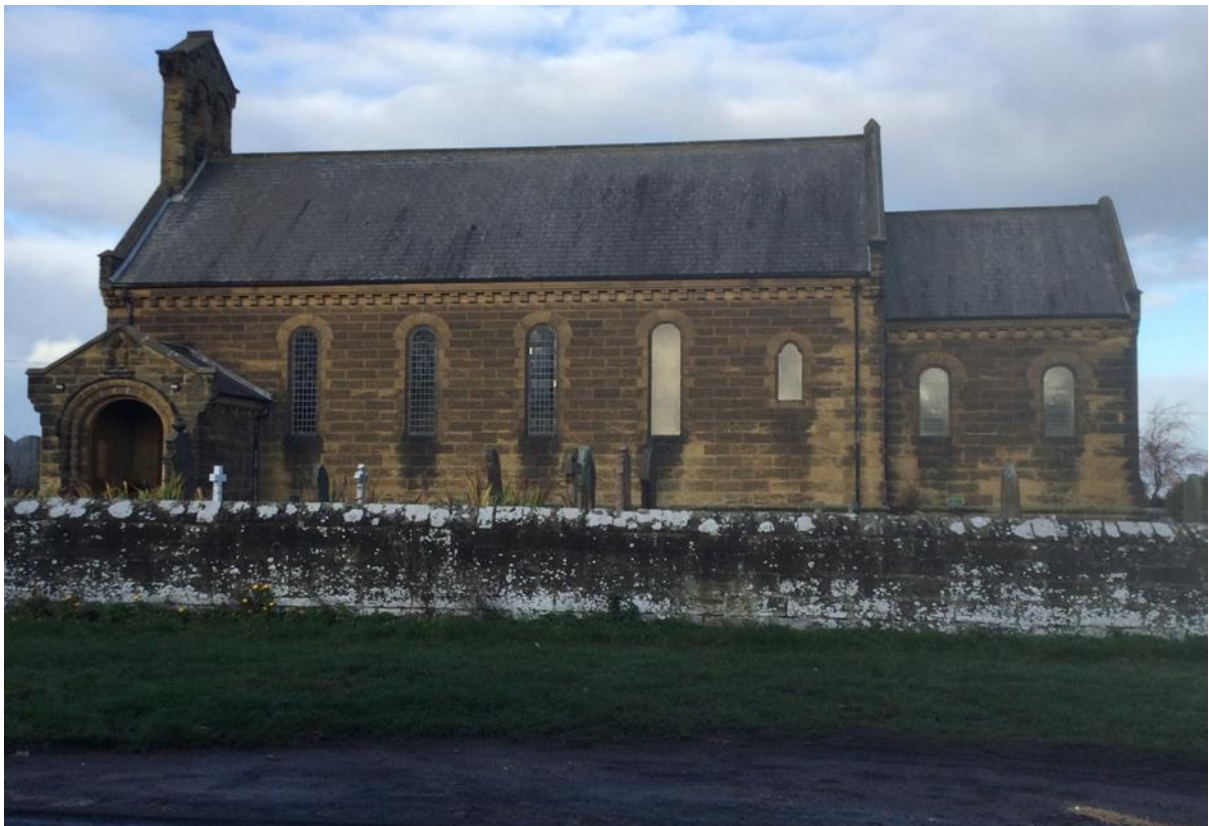
St Bartholomew's Church