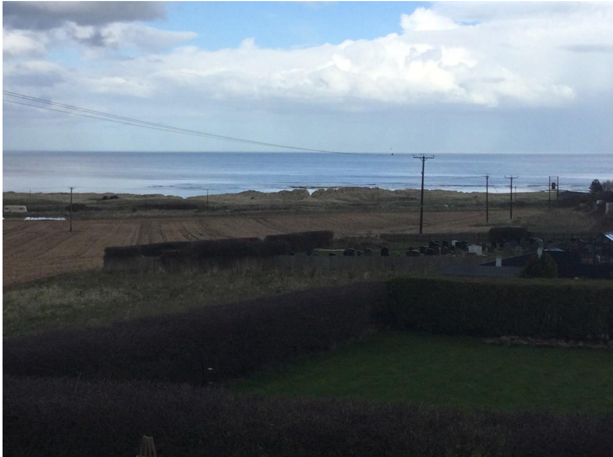
Field to the north of St Bartholomew's Church

The field north of St Bartholomew's Church (Lat 55° 14'1"N Long 1°32' 8"W) is not subject to planning permission for development, and is not allocated or proposed for development within the local plan. It is not currently allocated as a protected open space. Similar to proposed Local Green Space 5, it is used agriculturally by tenant farmers. It provides an important and valued rural backdrop to the village, with a rich variety of wild life, including the overwintering pink footed geese, pheasants, hares, and deer as well as contributing to dark skies .In addition the field has been planted with an area of wildflowers.