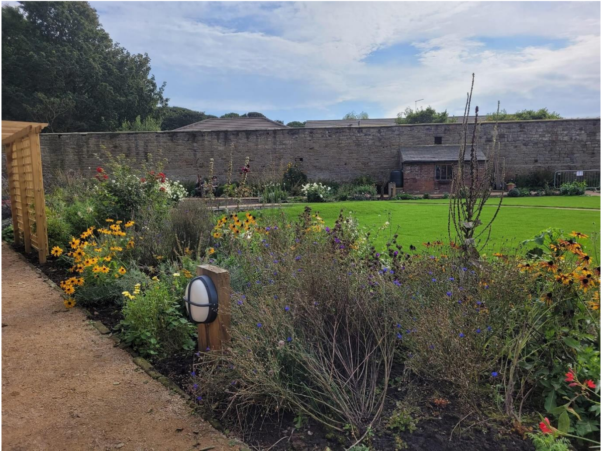
Walled Garden of The Pele Tower