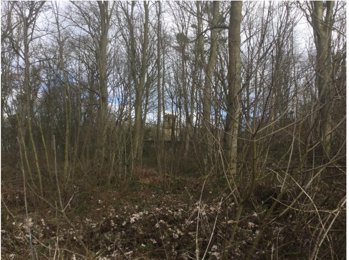
Hall Wood with the remains of Cresswell Hall