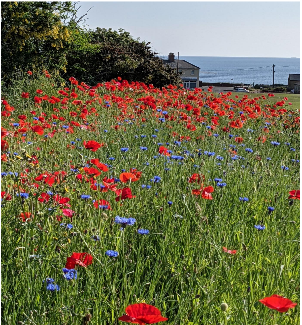
Wildflower area on Village Green