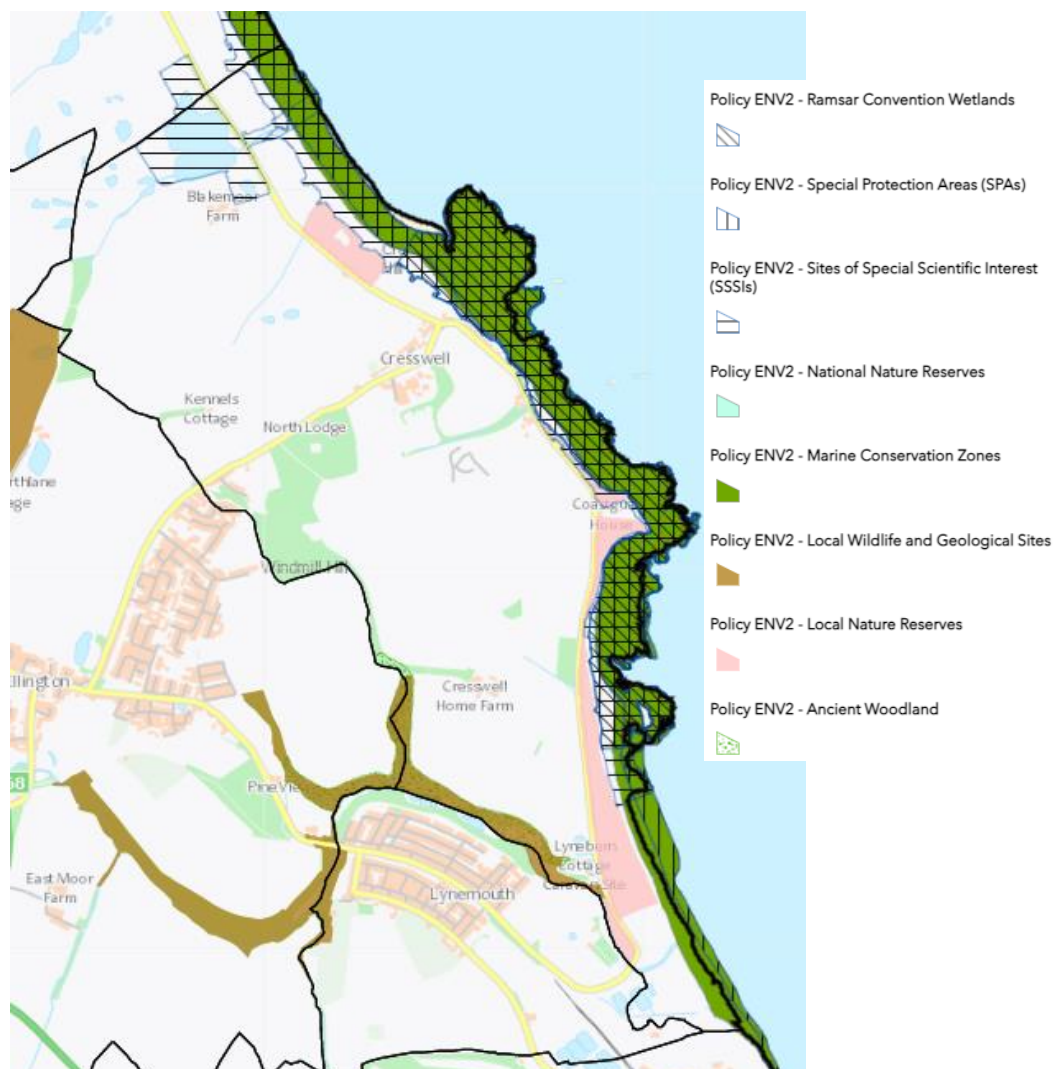
Figure 2-extract from the Local Plan policies map illustrating natural environment designations. ".