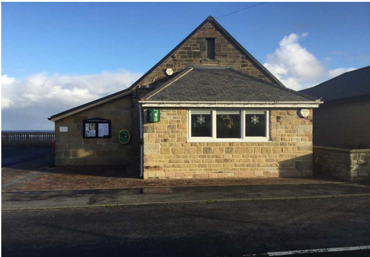
The Village Hall

2.13 The village has an ice cream shop, which is closed out of season, and a café just to the north of the village, open all year-round. There are two large caravan parks. There is no major commerce or industry and the working population commutes to work. Schools, shops and medical services are all in nearby villages and the local bus service provides a vital link to these. There is a village hall run by a charitable trust which offers small meeting and group facilities. Nearest major leisure facilities are in Morpeth, Ashington and Newbiggin.