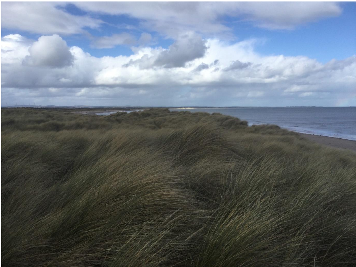
The Dunes looking North East

The Dunes (Lat 55° 14' – 14' 4"N Long 1° 32-33' W )are already designated as areas of conservation and part of the Northumbria Coast and Northumberland Marine Special Protection Area as well as sites of specific scientific interest. They are a valued recreational area for residents and visitors to the area .They provide a breath taking backdrop to the village of Cresswell. They are a favoured haunt of our local population of barn owls. It is proposed that they are allocated as a local green space. The land is not subject to planning permission for development.