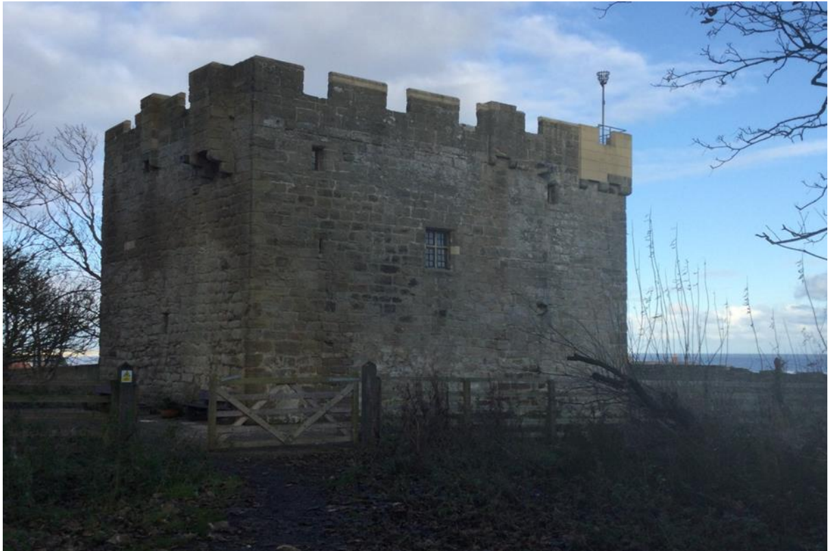
The Pele Tower