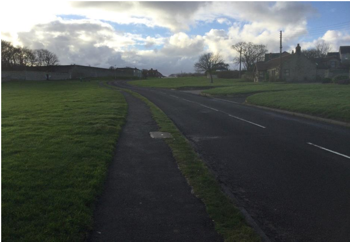
The Village Green

The village green ( Lat 55° 14' 1"N Long 1° 32' 5" W) is not subject of a planning permission for development, nor is it allocated or proposed for development within the local plan – it is allocated as a protected open space. The site is not an extensive tract of land, it is local in character – it extends to 2.78 hectare and lies within the centre of the village. The site is demonstrably special to the local community. It is an important space which is important to the character of the village and the setting of the grade II* listed Cresswell Tower, which is also a scheduled monument as well as the grade II listed buildings to the north (Old School House, Fenham House, Church Cottages, Church of St Bartholomew and the roadside wall from parish church to Old School House). The site is also valued by the local community as an informal recreation space. Whilst it is acknowledged that the site is protected as a village green, given its importance to the local community, it is proposed for allocation as a local green space.