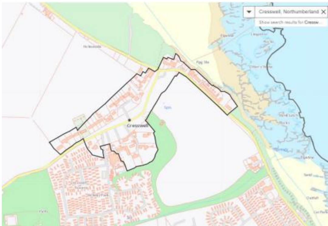
Figure 4 - Cresswell Village settlement boundary

6.1 National planning policy identifies that planning policies and decisions should avoid the development of isolated homes in the open countryside, unless specific criteria are met, which is also reflected within local plan policy STP1(Spatial Strategy). The local plan seeks to focus new development within sustainable locations. It includes a settlement hierarchy (policy STP1), which identifies that most development across the county will take place within main towns and service centres. The policy goes on to say ‘ Sustainable development will be supported... within settlement boundaries defined on the Local Plan policies map. ’ Cresswell has a settlement boundary, which is shown in figure 4.