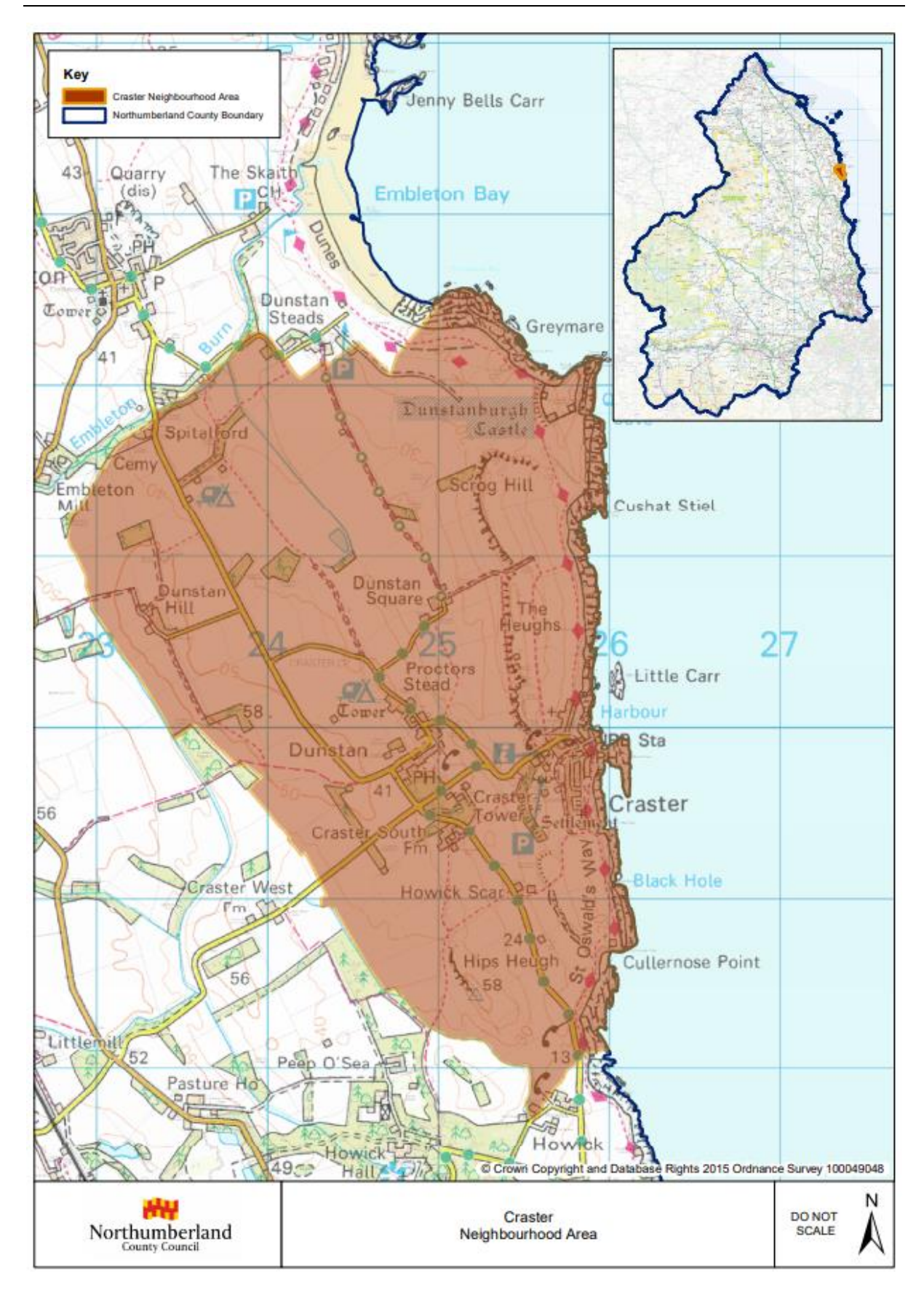
Figure 1: Craster Neighbourhood Plan Area