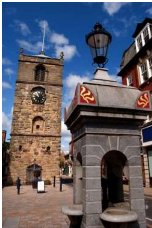
Hollon Fountain and Clock Tower

1.1.2 The process of plan preparation has been led by Morpeth Town Council as 'qualifying body' for neighbourhood planning purposes within the Morpeth Neighbourhood Area. Support and endorsement of the Plan has been provided by the adjoining Parish Councils representing the civil parishes of Hebron, Hepscott, Mitford and Pegswood all of which lie within the Morpeth Neighbourhood Area.