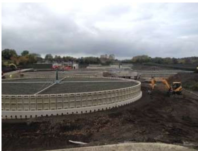
Development of Morpeth Sewage Treatment Works

19.1.3 This community action contributes to the delivery of Plan Objectives: PO3 (accommodating growth) and PO6 (reducing flood risk).