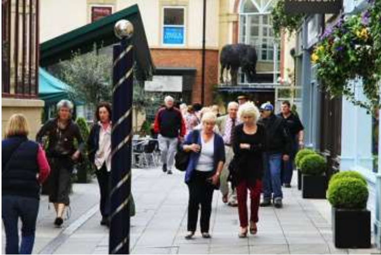
Sanderson Arcade Precinct, Morpeth

6.2.13 There is a resilient market for office space in Morpeth due to a healthy professional services sector supported by a large but diminishing public sector presence. Some 57% of office provision is in the town centre, with another cluster of office space at Telford Court, near to County Hall. An overall vacancy rate of 12% (draft Commercial Demand Study, 2015) indicates that the market is broadly in equilibrium.