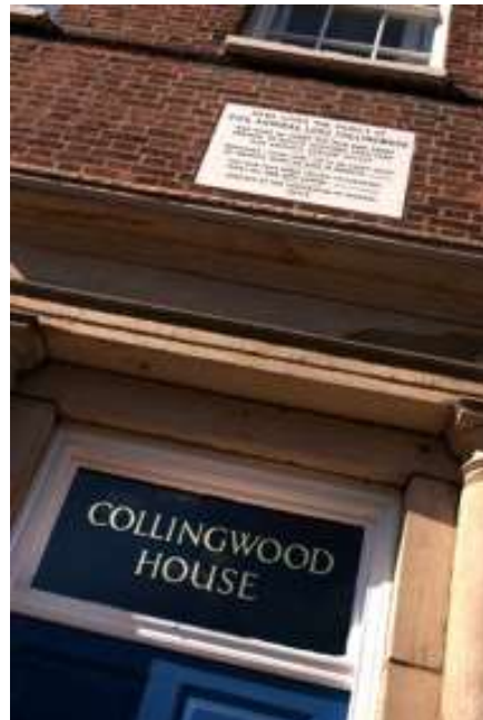
Collingwood House, Oldgate

14.4.5 The Community Action aims to secure measures to better appreciate the character and significance of the historic town centre. This is in order to improve its conservation and management and to ensure that any new development in the town centre is designed appropriately to a high quality to enhance the area. The review should include an assessment of the important vistas that contribute to the setting of the conservation area and significant historic assets such as Morpeth Castle.