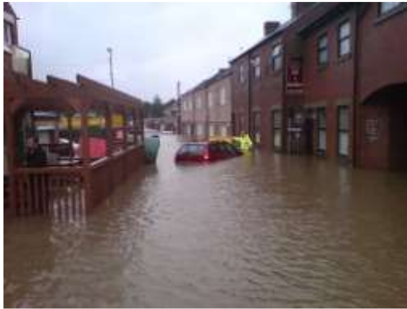
Morpeth town centre flooding, 2008

10.1.1 Morpeth has a combined sewer and surface water system near the town centre, and separate systems in the more recent developments away from the town centre.