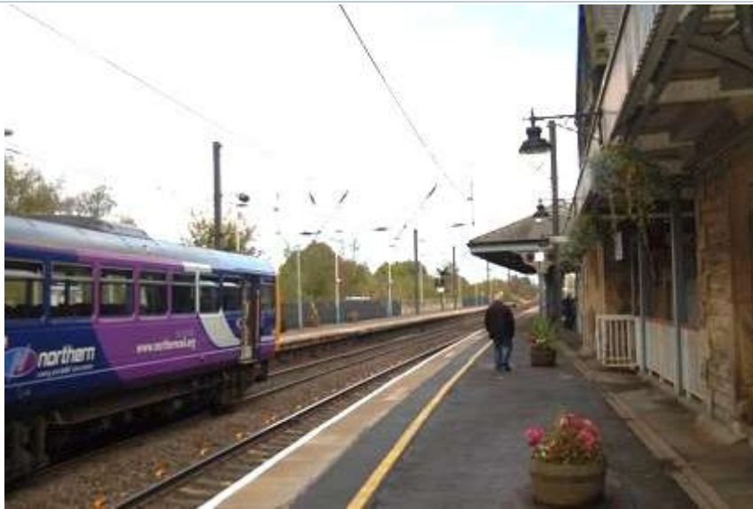
Morpeth rail station

8.5.8 Morpeth also has the most active bus station in the county with services to Newcastle; to Alnwick, Berwick and the mid and north Northumberland coast; and to south east Northumberland. Local in-town services and services to the rural villages to the north and west are relatively poor. The Morpeth 'bus service hub' contributes considerably to the existing day-visitor economy, particularly amongst older people who benefit from free bus travel.