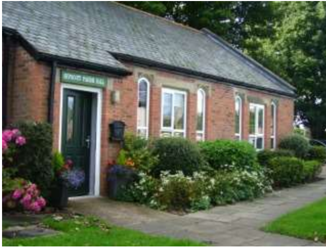
Hepscott Village Hall

2.1.7 Mitford is a largely un-spoilt parish situated approximately 2 miles west of Morpeth. With a parish population of 448, Mitford is a dispersed settlement with two main residential groupings at Fontside and Stable Green. The topographically complex and special setting of the village led to it being included in an area defined as being of High Landscape Value through policies contained in the Castle Morpeth District Local Plan (2003) in order to protect it from development that could detract from its character. Only limited infill development within the established settlement boundary has therefore been permitted.