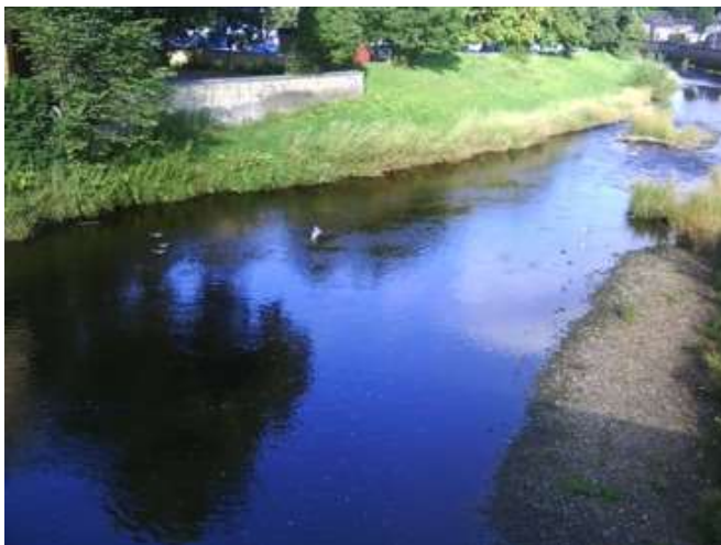
River Wansbeck wildlife corridor

5.4.2 This policy contributes to the delivery of Plan Objectives: PO1 (historic market town character), PO3 (sustainable location of development), PO7 (community wellbeing).