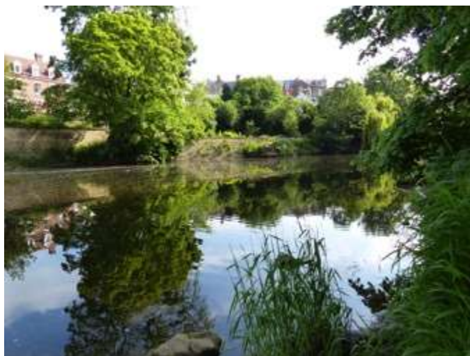
River Wansbeck from High Stanners

3.1.5 Similarly, the emerging Core Strategy and the National Planning Policy Framework set out strategic principles addressing the need for the prudent use of natural resources and the conservation of natural capital. Whilst no need has been identified for a distinctive specific local objective and policies, the objectives relating to local identity, accommodating growth, reducing flood risk and protecting heritage and natural assets are all aligned with these strategic principles. In addition, the policies that stem from those principles address biodiversity, green infrastructure and sustainable water management in an appropriately local manner.