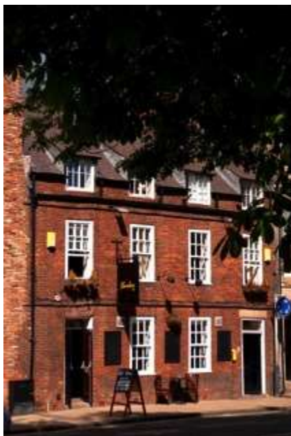
Bridge Street from the Chantry

14.3.1 There is an existing local list of valued but under-protected buildings and monuments. This list will be developed with a view to adding new items to support their conservation against future threats.