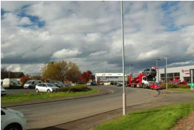
Coopies Lane business park, Morpeth

6.4.4 Morpeth has a well-established business park at Coopies Lane, mainly accommodating local traders, wholesalers and automotive businesses, though with a number of national and international businesses, notably Coca Cola Enterprises. It is important to the local economy in providing employment opportunities and premises for local businesses. There appears to be a good mainly local demand for vacant units as they become available. Although there is limited space for new development and fragmented ownership would make refurbishment or redevelopment difficult, its retention for employment generating uses remains a priority.