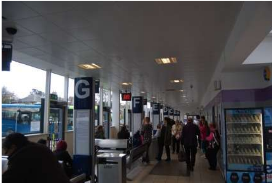
Morpeth bus station

8.5.14 This policy contributes to the delivery of Plan Objectives: PO4 (developing Pegswood) and PO9 (connectivity).