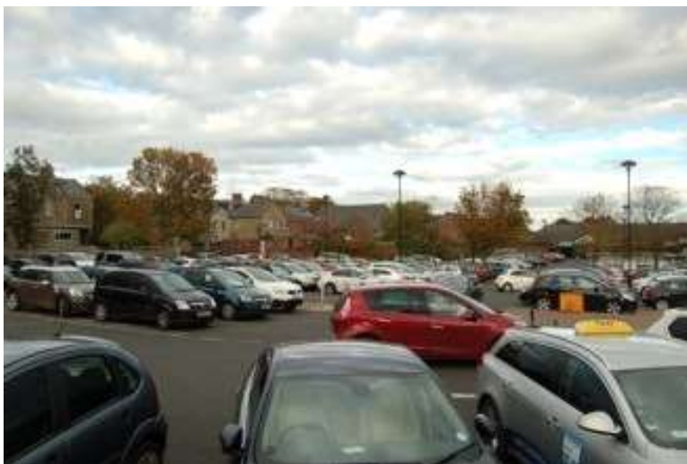
Town centre car parking

17.3.2 This community action contributes to the delivery of Plan Objectives: PO2 (rural service centre) and PO3 (accommodating growth).