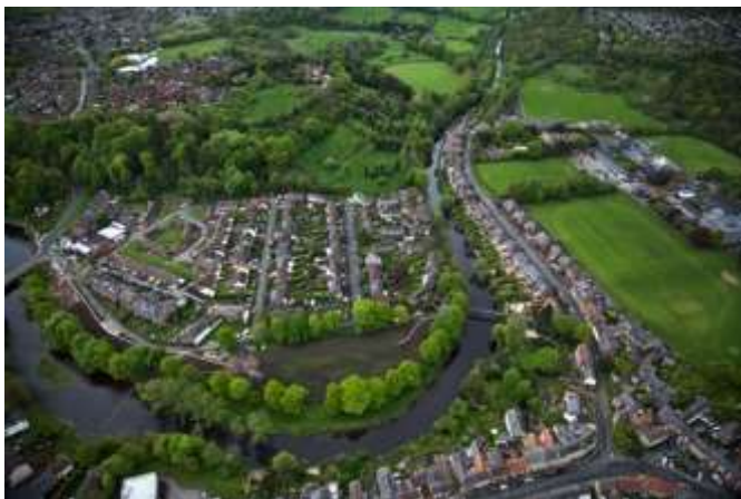
High Stanners, Morpeth from the air

3.3.3 The strategy for the rural areas is to retain the identities of the villages and to improve the natural environment in and around them. The development of Pegswood as a more sustainable community will be supported by providing residential development proportionate to the needs of the community and improvements to the village centre. New small scale retail and business uses will be encouraged to support a healthy rural economy particularly where it will make use of redundant sites and buildings. Improvements to community facilities, the footpath network and the countryside and wildlife environment in and around the villages will be encouraged.