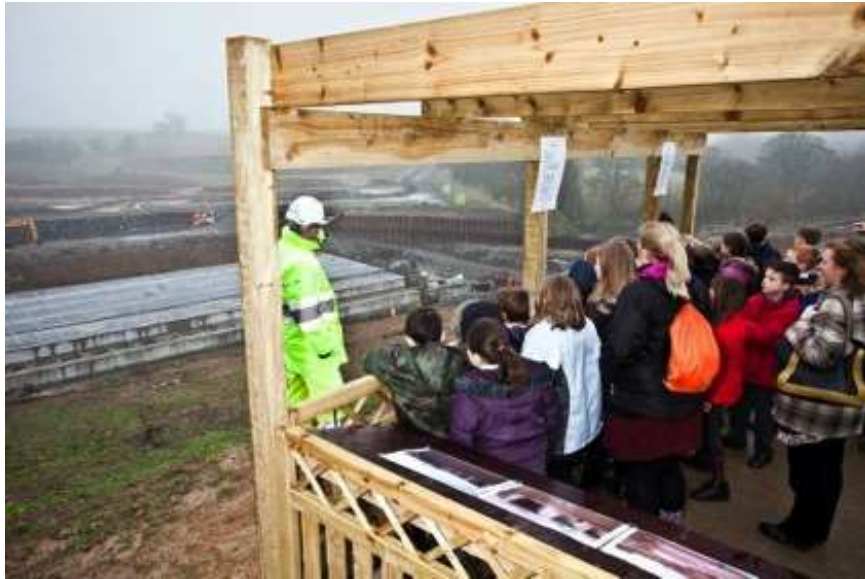
School pupils viewing the Morpeth Protection Scheme