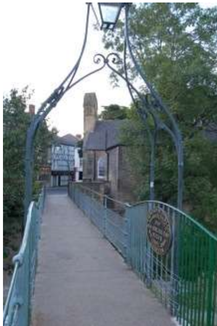
The Chantry Footbridge

4.2.7 A range of documents is available which promote high quality design, such as "Building for Life 12" by CABI at the Design Council, "Good Design – It All Adds Up" (2012) by Royal Institute of British Architects and "Sustainable Design and Construction" (Aug 2012) – a cross sector document by various institutions including Royal Town Planning Institute, Building Research Establishment, and Landscape Institute.