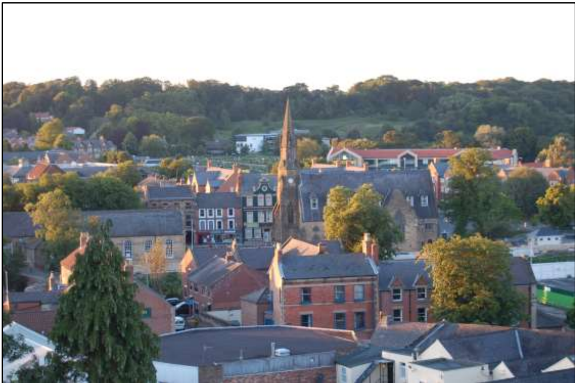
View across Morpeth town centre