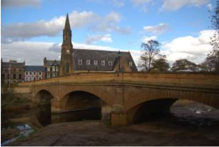
The Telford Bridge, Morpeth

17.1.2 A number of highways modifications have been identified to improve the road network in and around Morpeth, but these need to be developed by the Highways Authority and/or the Highways England and cannot be brought forward as planning policies in this Plan.