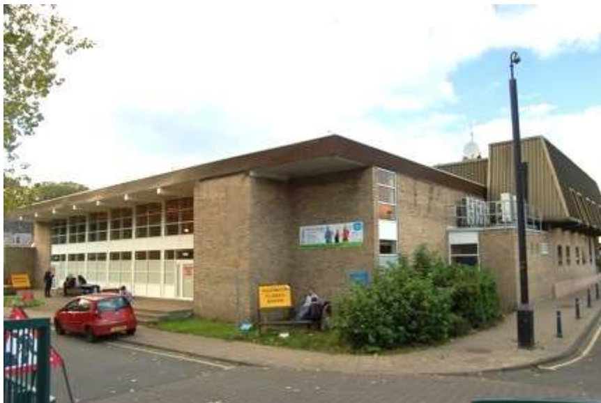
Morpeth Leisure Centre

9.1.7 The Riverside Leisure Centre is an essential facility in supporting future community health and wellbeing, but is widely acknowledged not to be up to modern day standards. With 20% housing and population growth proposed, there will be considerably more demand for leisure centre facilities. Relocation should be considered if a better site can be found, but a town centre location with access to long-term car parking is considered preferable as the Leisure Centre contributes to the viability of the town centre.