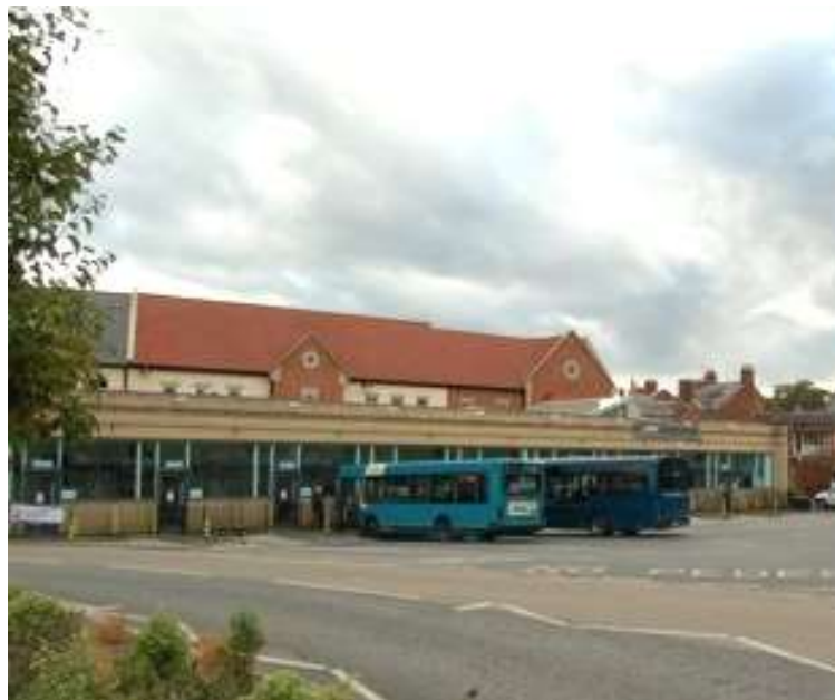
Morpeth bus station

17.4.4 Morpeth also has the most active bus station in the county with services to Newcastle; to Alnwick, Berwick and the mid and north Northumberland coast; and to SE Northumberland. Local in-town services and services to the rural villages to the north and west are relatively poor. The Morpeth 'bus service hub' contributes considerably to the existing day-visitor economy, particularly amongst older people who benefit from free bus travel.