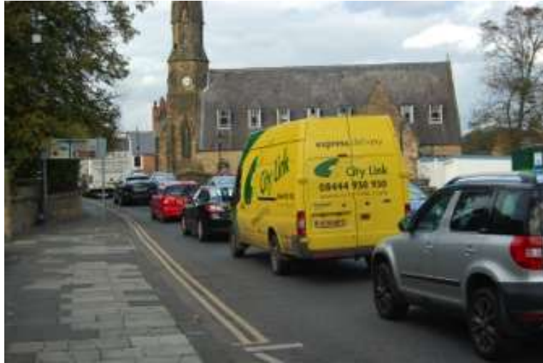
Traffic congestion on the Telford Bridge, Morpeth

8.1.1 Transport policies need to be integrated with policies for the economy, the environment, and the commercial, educational and social development of the town. This will enable a comprehensive and integrated vision for the development of Morpeth as a quality place to live, work and spend leisure time. The challenge is to plan for the most acceptable balance between ease of travel and the impacts of transport systems, by embracing the different needs of all sectors of the community; recognising the different functions of transport for various activities; and minimising the adverse effects of transport in those places where they are most significant.