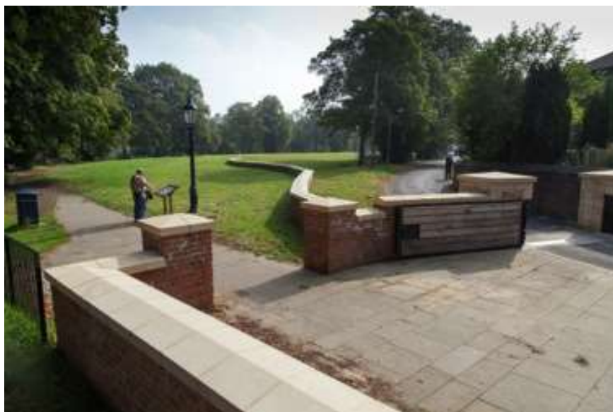
New flood defences at High Stanners

10.1.2 Decisions about new housing have tended to be taken incrementally, without a strategic overview. New developments have fed into the existing combined sewerage system in Morpeth, which tends to overflow following heavy rain, and also discharged surface water to the many burns feeding into the River Wansbeck. In recent years weather conditions have challenged the existing drainage network, leading to numerous serious localised surface water issues and discharges into burns have exacerbated the situation. Historically the town is susceptible to flooding from the River Wansbeck, while Hepscoth, which lies on the River Blyth system and not the Wansbeck, also has serious localised flooding issues in intense weather conditions. In 2008 nearly 1000 properties in the Morpeth Neighbourhood Area were damaged and many people evacuated from their homes for months on end, causing widespread distress and cost. A further serious incident followed in 2012. It is in the light of this history that the flood policies in the Neighbourhood Plan should be particularly robust.