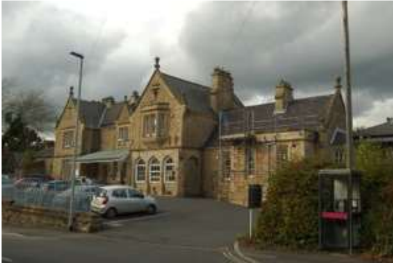
Morpeth train station

17.4.2 Reliable and frequent rail services can contribute both to sustainable local travel options and long distance and intercity travel.