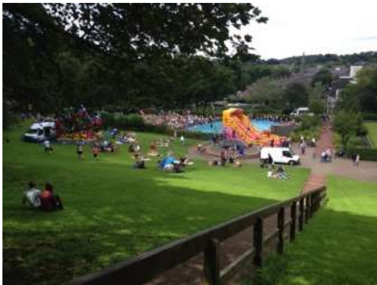
Busy summer's day at Carlisle Park

6.1.6 The MNP plans to strengthen the economic role of both Morpeth as a rural service centre and the wider Plan area. In addition to providing strategic employment sites to attract inward investment, Morpeth also needs to create more service jobs by taking full advantage of the town centre as an economic driver, and its potential to act as a tourism 'hub'. Morpeth has a good retail offer with a mix of independent stores and national multiples. This combines with the quality and ambience of the town to give the town centre vibrancy. The MNP supports additional developments and initiatives that might further strengthen the town centre's role. New development areas in or adjacent to the town centre, and the development and use of redundant buildings are highlighted. Developing new sites, coupled with a heritage centre or museum and new sports, arts and leisure facilities would considerably strengthen Morpeth's visitor offering.