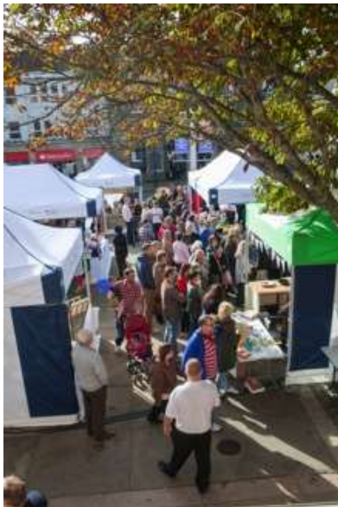
Market Square, Morpeth

6.1.3 As a commercial location Morpeth has considerable potential for strong employment growth in the right economic climate, due to its own attractive surroundings and accessibility to Tyneside. The new Morpeth Northern Bypass completing the South East Northumberland Strategic Link Road may also increase the town's attractiveness to new investment. However, Morpeth suffers from a lack of strategic employment sites. Until recently there were three long-standing allocated employment sites at Fairmoor, north of the town. These sites already have direct access to the A1 and the new Morpeth Northern Bypass was set to improve their attractiveness with a new north to south intersection and connection eastwards to South East Northumberland. The MNP supports the retention of these sites as locations for strategic serviced business park development. Despite this and their long-standing designation in the Castle Morpeth District Local Plan and the emerging Northumberland Local Plan, recent planning decisions taken in the absence of an up-to-date adopted Local Plan have granted new housing on two of these potential strategic employment sites.