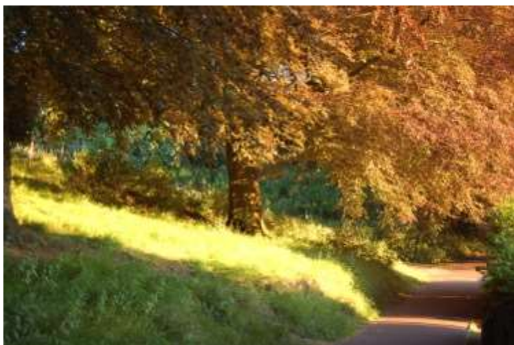
Mature trees in Carlisle Park

14.2.1 A programme of street tree replacement, planting and tree management around buildings has been adopted in the MNP drawing upon the existing NCC tree strategy. This will be supported by guidance for dealing with existing problems, such as loss of light and root damage, and guidelines for planting around new development.