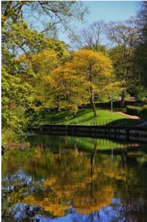
Carlisle Park and River Wansbeck