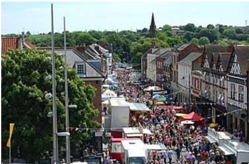
Bridge Street on Morpeth Fair day

6.2.10 The strategy is to safeguard and enhance the town centre for appropriate uses in each sub-area and to enhance its environment. The policy recognises the importance of the town centre as an employment location for a wide range of businesses and seeks to develop the centre to attract more visitors both to the shops and the leisure and cultural facilities.