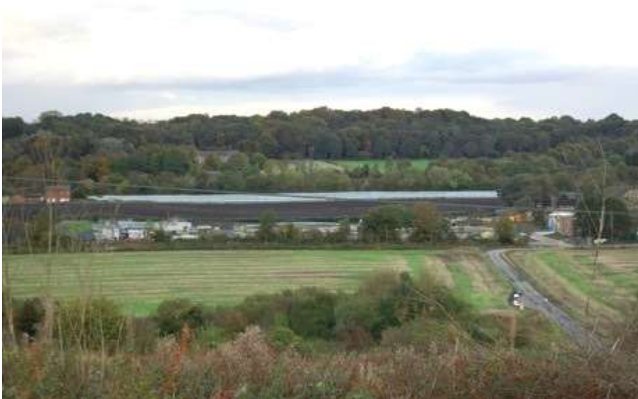
Morpeth Sewage Treatment Works

22.1.1 Provision of the necessary physical and community infrastructure arising from proposed development is a critical component of the Plan. Many diverse elements of required infrastructure are not necessarily of direct commercial benefit to developers, but nevertheless are essential and their provision needs to be timely if infrastructure deficiencies are to be avoided. These include school provision; improvements to the road network; pedestrian facilities; increased and improved sewerage capacity; affordable housing; flood defences; playing fields; allotments and playgrounds. Other potential community infrastructure projects include environmental schemes; community facilities; community initiatives; sports, arts and leisure facilities; cycle and public transport improvements.