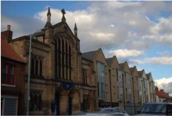
Manchester Street, Morpeth

7.3.1 As part of the preparation of the Neighbourhood Plan four alternative scenarios were developed for the distribution of housing development in Morpeth and three were developed for Pegswood. These scenarios were subsequently assessed as part of preparing the Strategic Environmental Assessment (SEA). The results of this assessment were then taken forward as a preferred option for the broad location of housing for Morpeth and Pegswood.