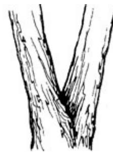
When co-dominant stems develop, bark may become "included" in the crotch. It is best to prune one of the stems while the tree is young.

The side branches contribute to the development of a sturdy, well tapered trunk. It is important to leave some of these low side branches in place, even though they can be pruned out later if you wish.