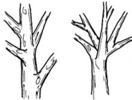
Branches should be well spaced radially and along the trunk as shown in the tree on the left.

Good pruning techniques remove structurally weak branches while maintaining the natural form of the tree.