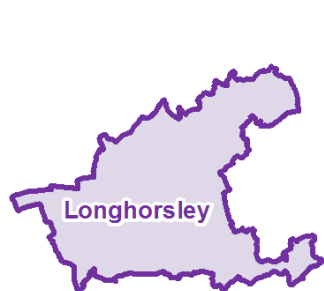
Area 24,289 ha / 243 sq km