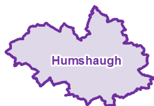
Area 30,169 ha / 302 sq km