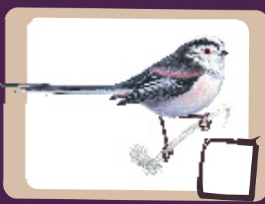
Long tailed tit