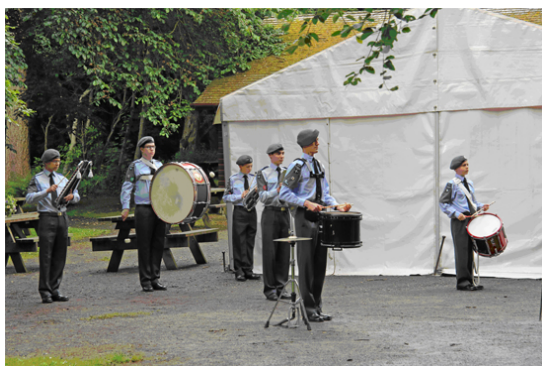
The Band of 2344 Air Cadet Squadron.