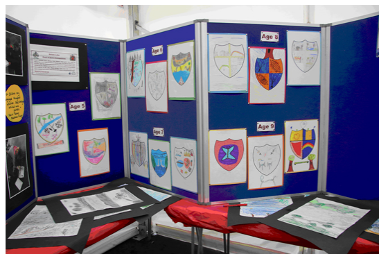
Belsay School Competition