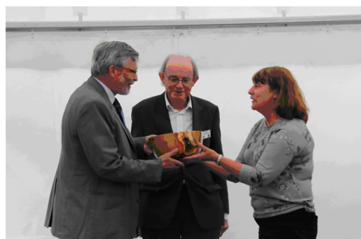
Presentation of Yew wood bowls