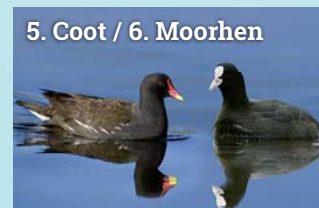
5. Coot / 6. Moorhen

Eats: Fish, aquatic insects Eaten by: Foxes, large birds Found: Near water