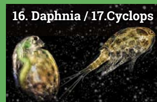
16. Daphnia / 17. Cyclops

Eats: Uses photosynthesis Eaten by: Birds (seeds) Found: Lake edges