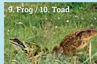
9. Frog / 10. Toad

Eats: Insects, larvae, worms Eaten by: Pike Found: Midwater