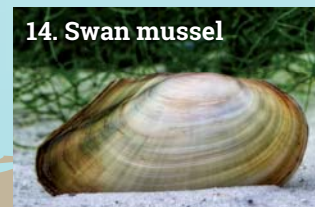
14. Swan mussel

Eats: Larvae, algae Eaten by: Fish Found: Lake bottom