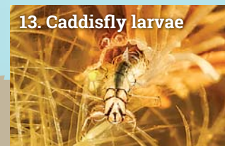
13. Caddisfly larvae

Eats: Small insects Eaten by: Fish, birds, frogs, toads Found: Lake surface