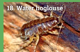
18. Water hoglouse

Eats: Algae Eaten by: Small fish Found: Freshwater