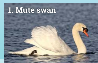
1. Mute swan

Bolam Lake is teeming with life which comes in all shapes and sizes from microscopic plankton and algae to large birds such as swans and big fish like pike. See what you can spot in and around our lake today.