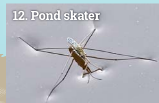
12. Pond skater

Eats: Insects Eaten by: Birds, spiders, frogs Found: Resting on vegetation