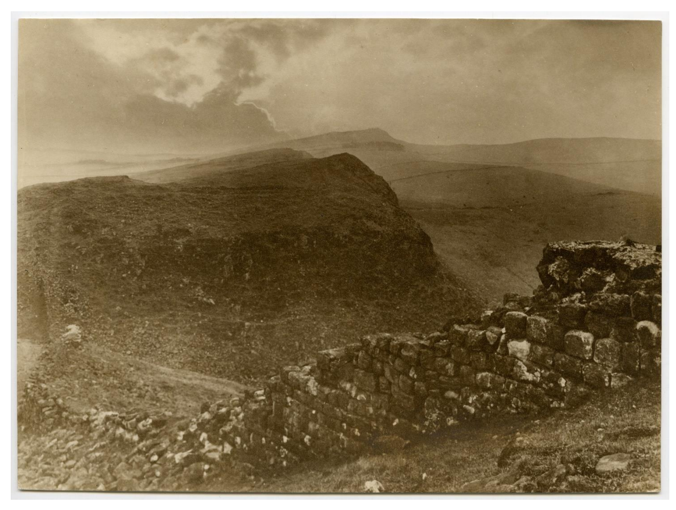
Roman Wall climbing near Milecastle 40, Winshields (c1905)