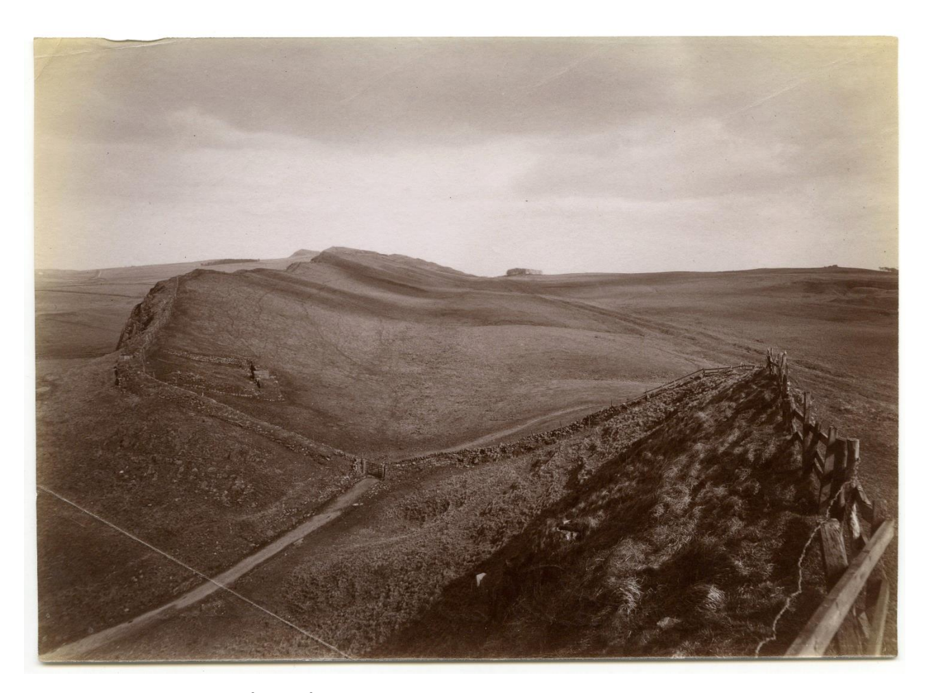
Milecastle 42, Cawfields (c1905)