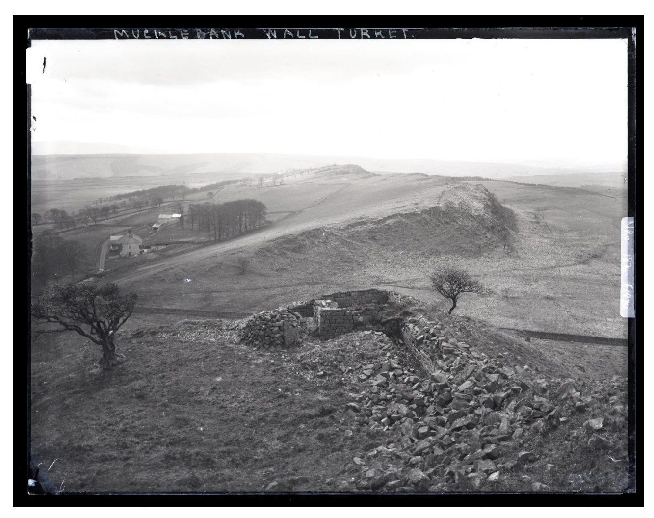
Turret 44b, Mucklebank near Walltown Crags looking west (c1892)