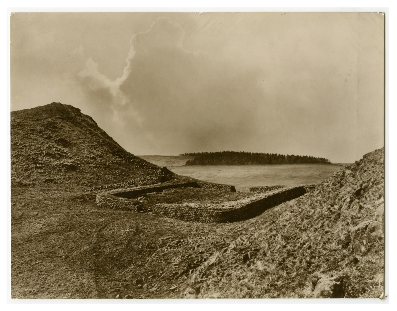
Castle Nick, Milecastle 39 (c1905)