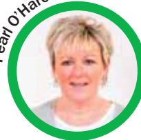
Team Leader Blyth North and Alnwick Area