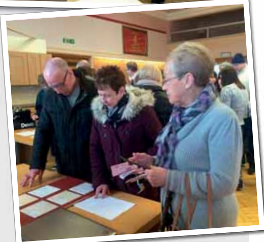
Photos: Tenants viewing home improvement choices at events in Amble and Blyth.

The housing improvement work is part of a five year, £31 million scheme to upgrade properties and includes kitchen and bathroom replacements, electrical rewiring, new heating systems, replacement roof coverings and windows.