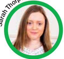
Team Leader Blyth South