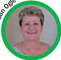
Head of Housing Management