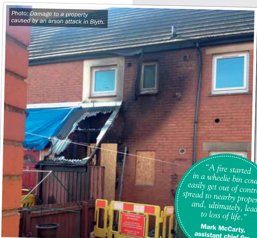
Photo: Damage to a property caused by an arson attack in Blyth.

"A fire started in a wheelie bin could easily get out of control, spread to nearby properties and, ultimately, lead to loss of life."