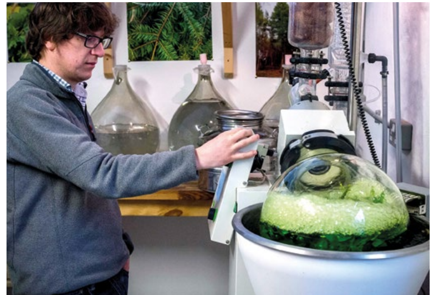
Moorland Spirit Co, Morpeth