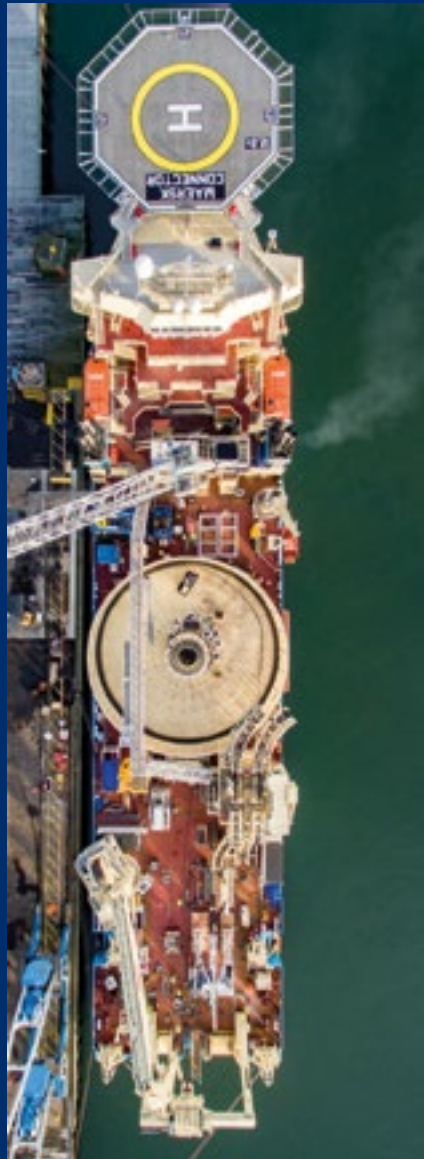
Deep Ocean, the Maersk Connector Vessel docked at Energy Central / Port of Blyth

Northumberland is home to leading global industries and is well placed to deliver against the grand challenges of the national Industrial Strategy. The county has businesses operating in globally competitive supply chains, and unique assets for large scale investment.