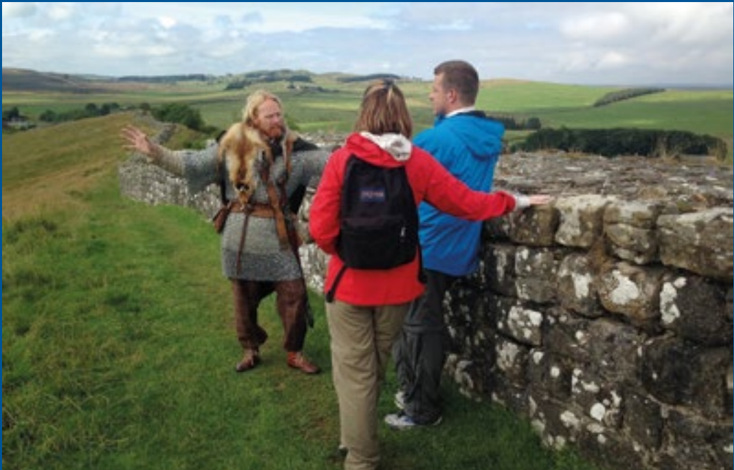
Ancient Britain Guided Tours, Hadrians Wall UNESCO World Heritage Site