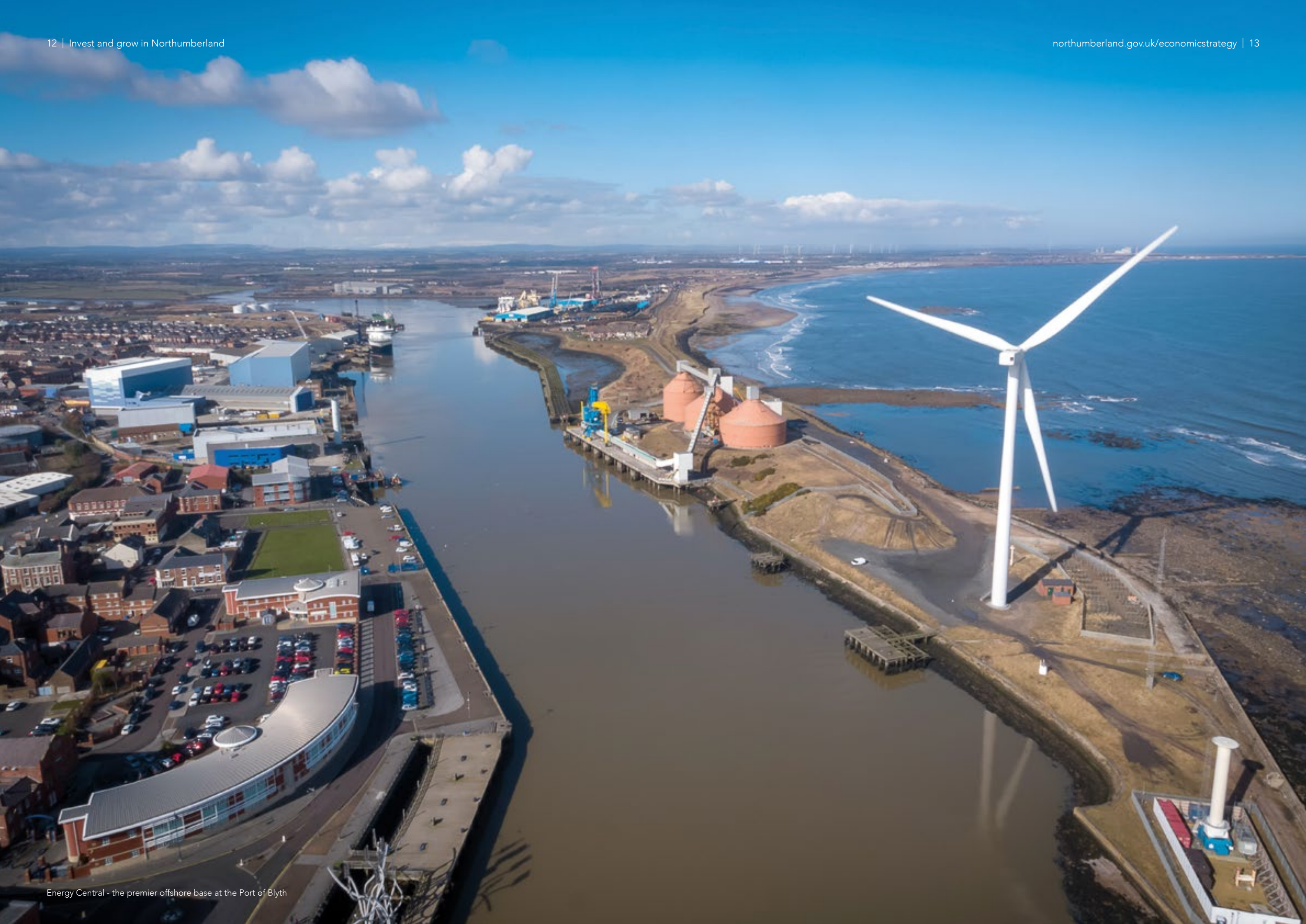
Energy Central - the premier offshore base at the Port of Blyth