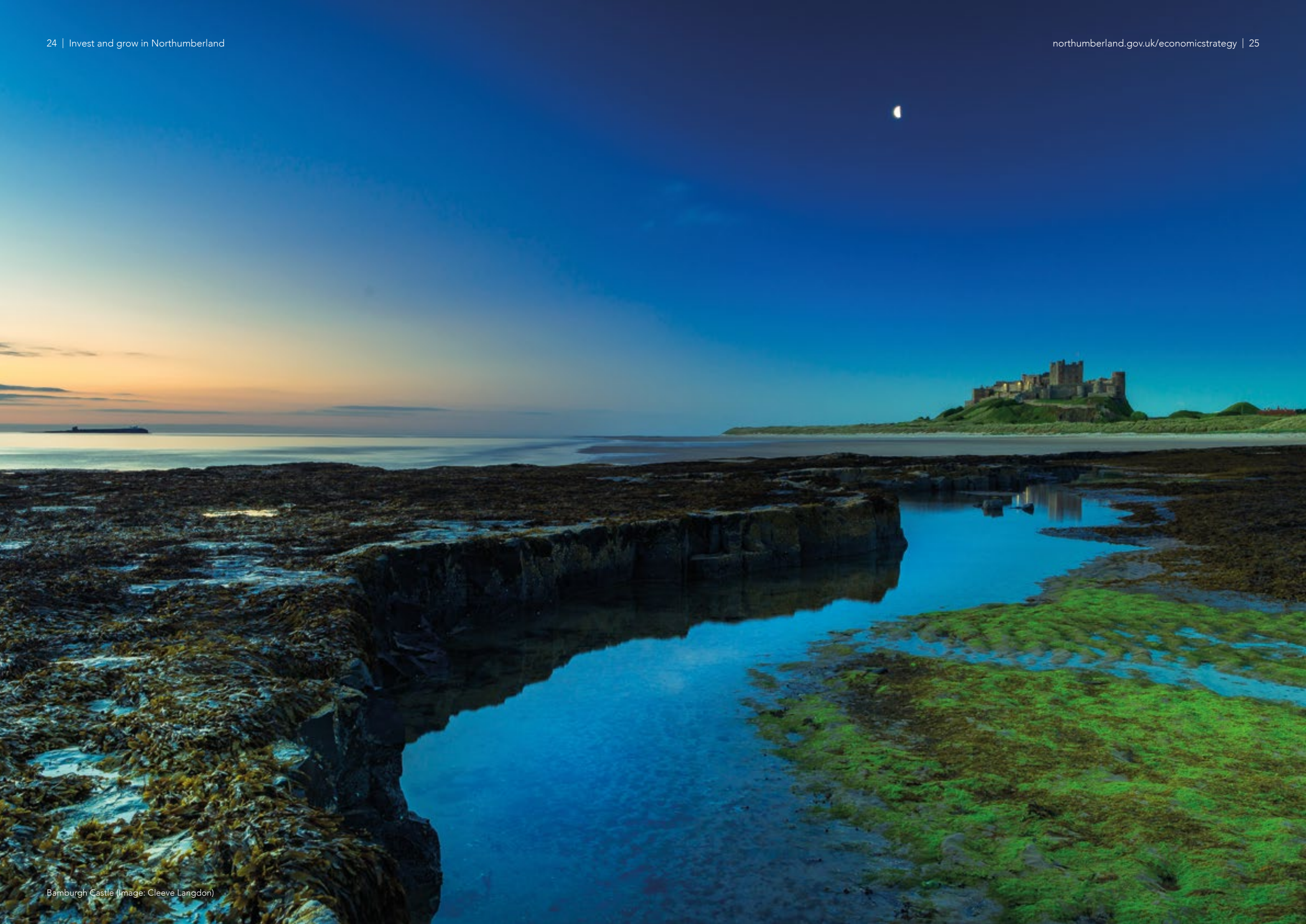
Bamburgh Castle