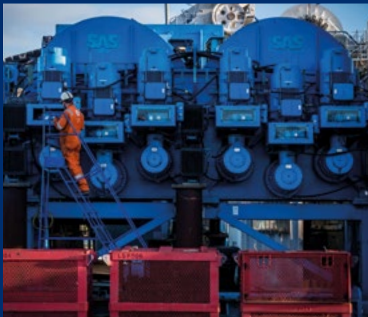
Deep Ocean Offshore Services Base, Blyth