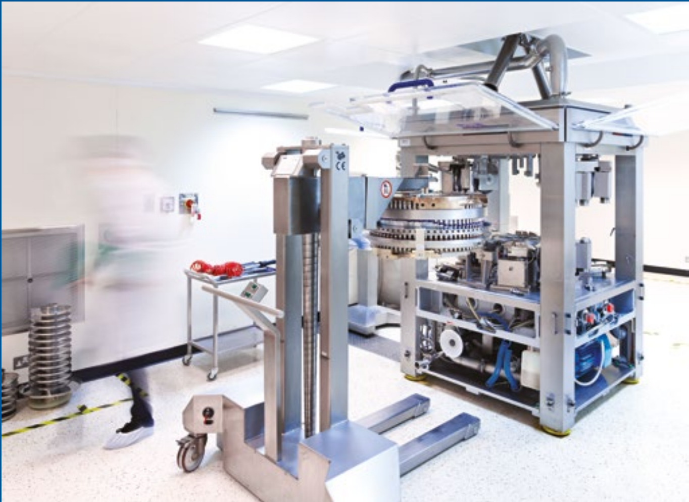
Merck Sharp and Dhome - one of the top five UK biopharmaceutical companies, Cramlington Essity - global hygiene and health company, Prudhoe