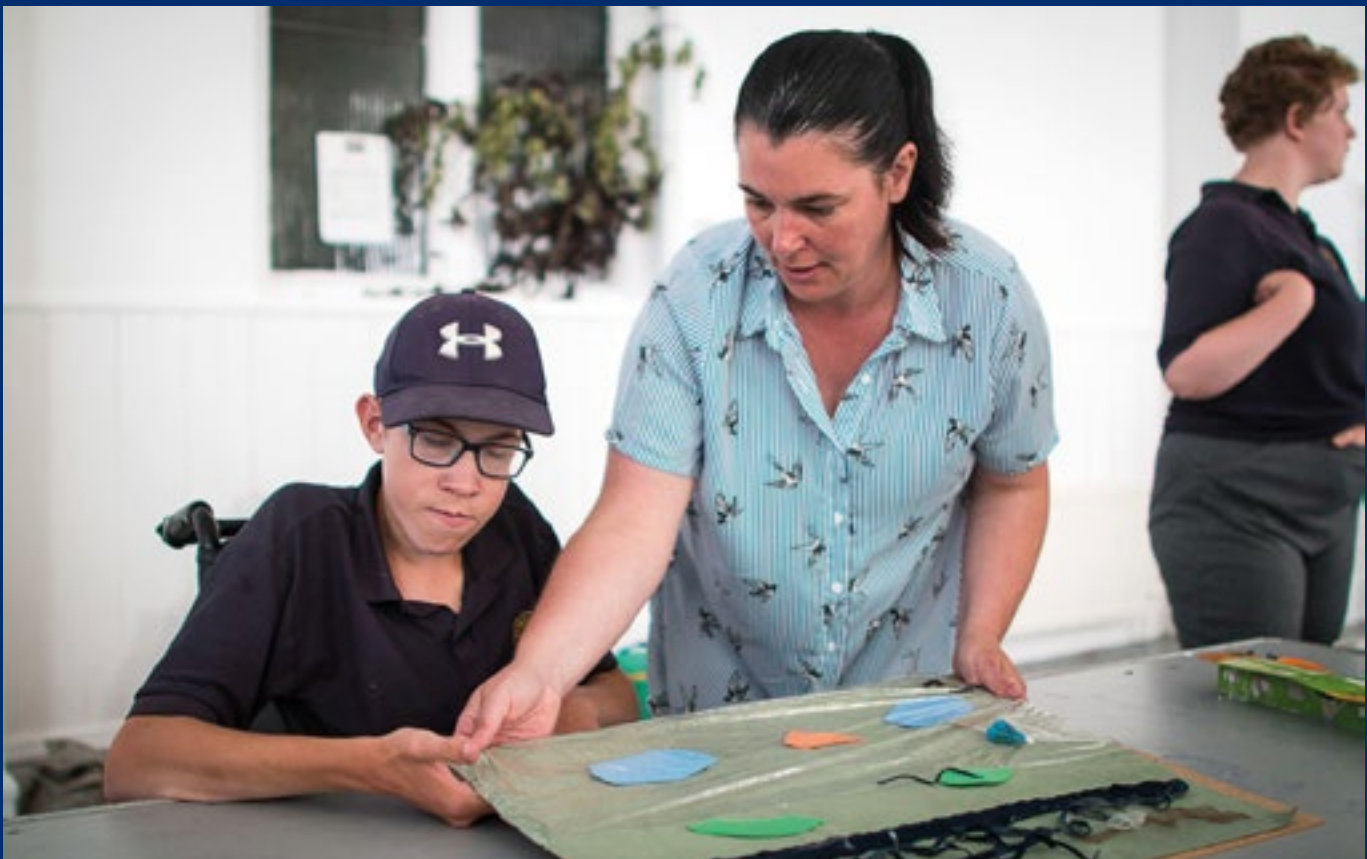
Great Northumberland community event