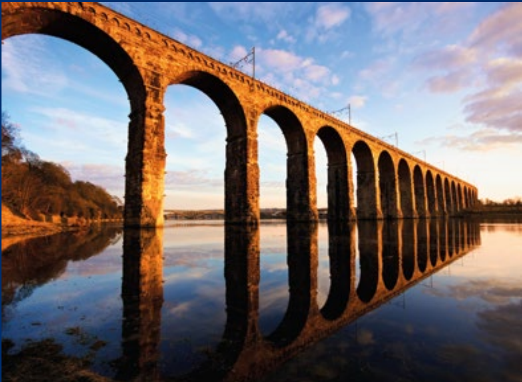
Royal Border Bridge, Berwick