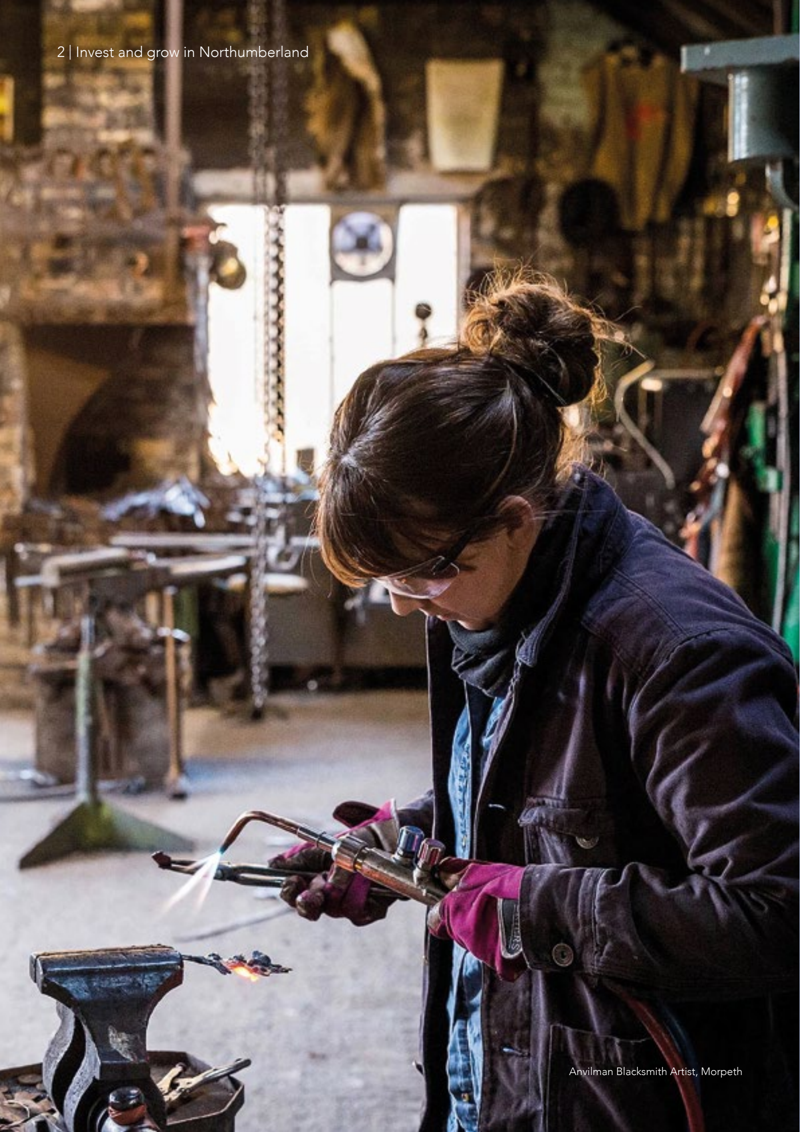
Anvilman Blacksmith Artist, Morpeth