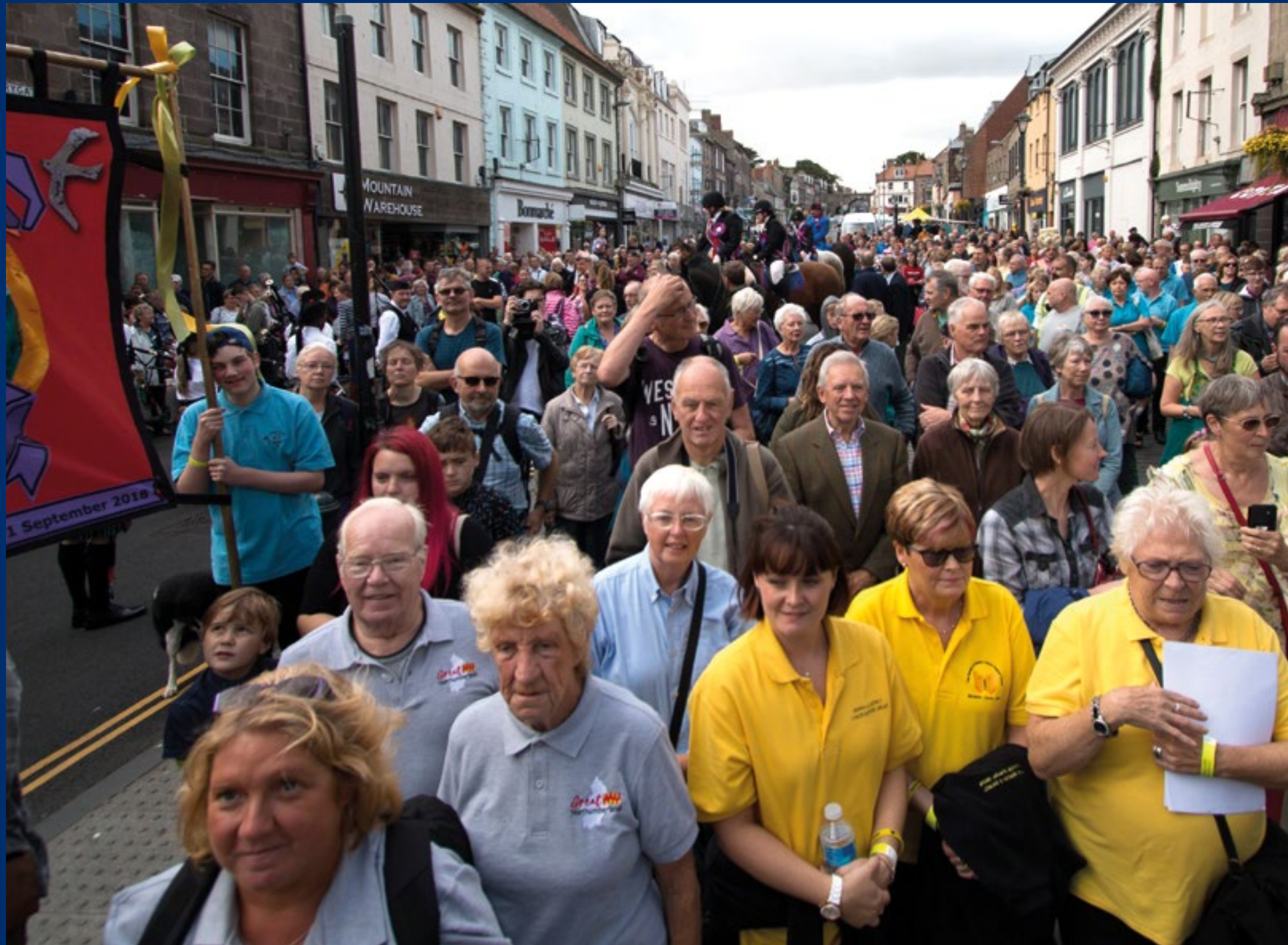
Great Northumberland Event Finale, Berwick

The Northumberland Economic Strategy is about delivering real change in our communities. Delivery will require communities, businesses, the public and voluntary sectors to come together to realise our potential. This involves working at different economic geographies that make sense to communities and reflect where and how people live their lives and the types of businesses and their support requirements.