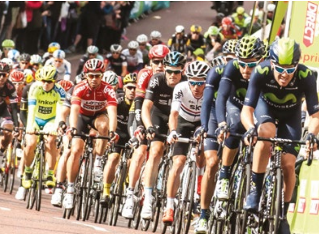
Tour of Britain Event, Alnwick