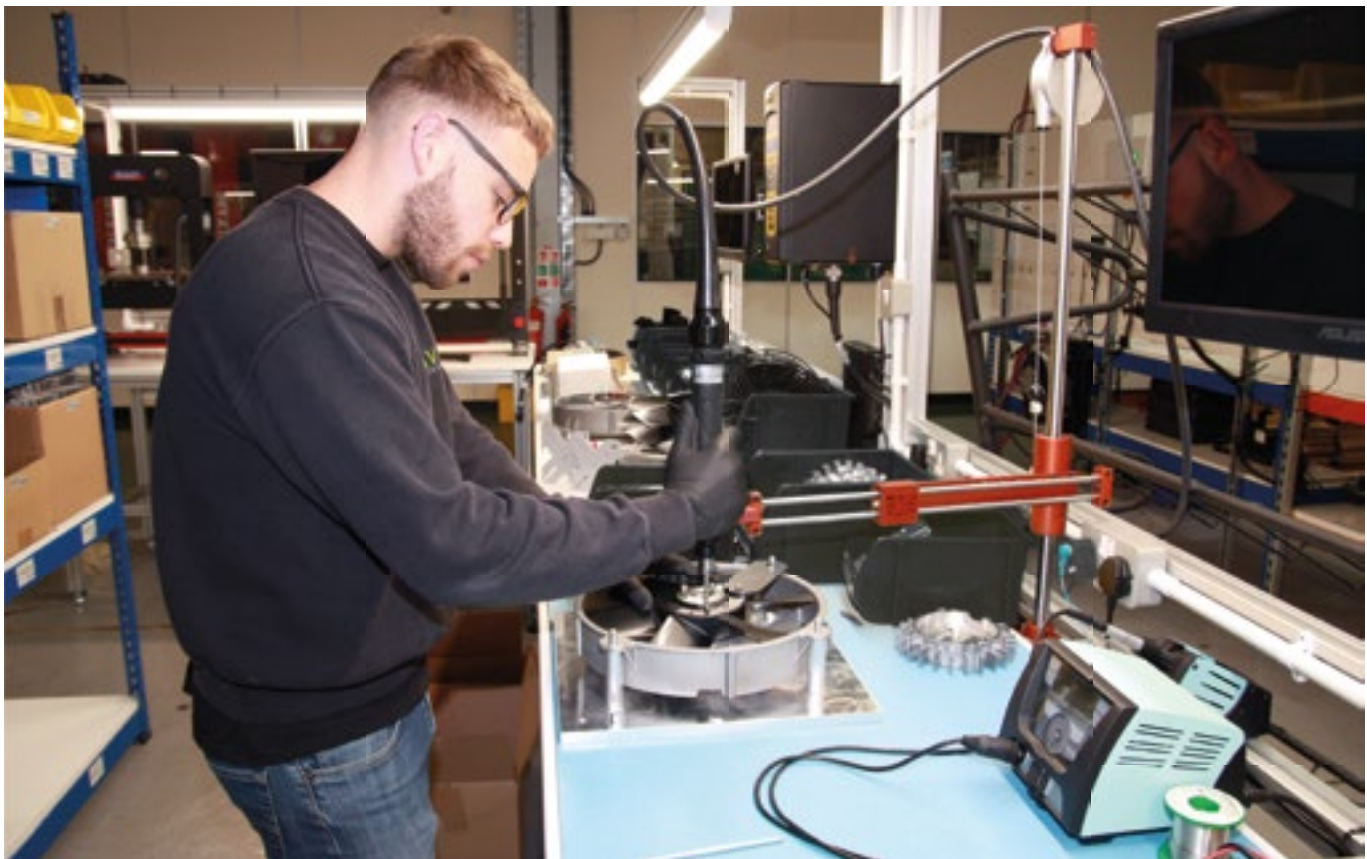
Avid Technology - design and manufacture of electrified powertrain technology, Cramlington