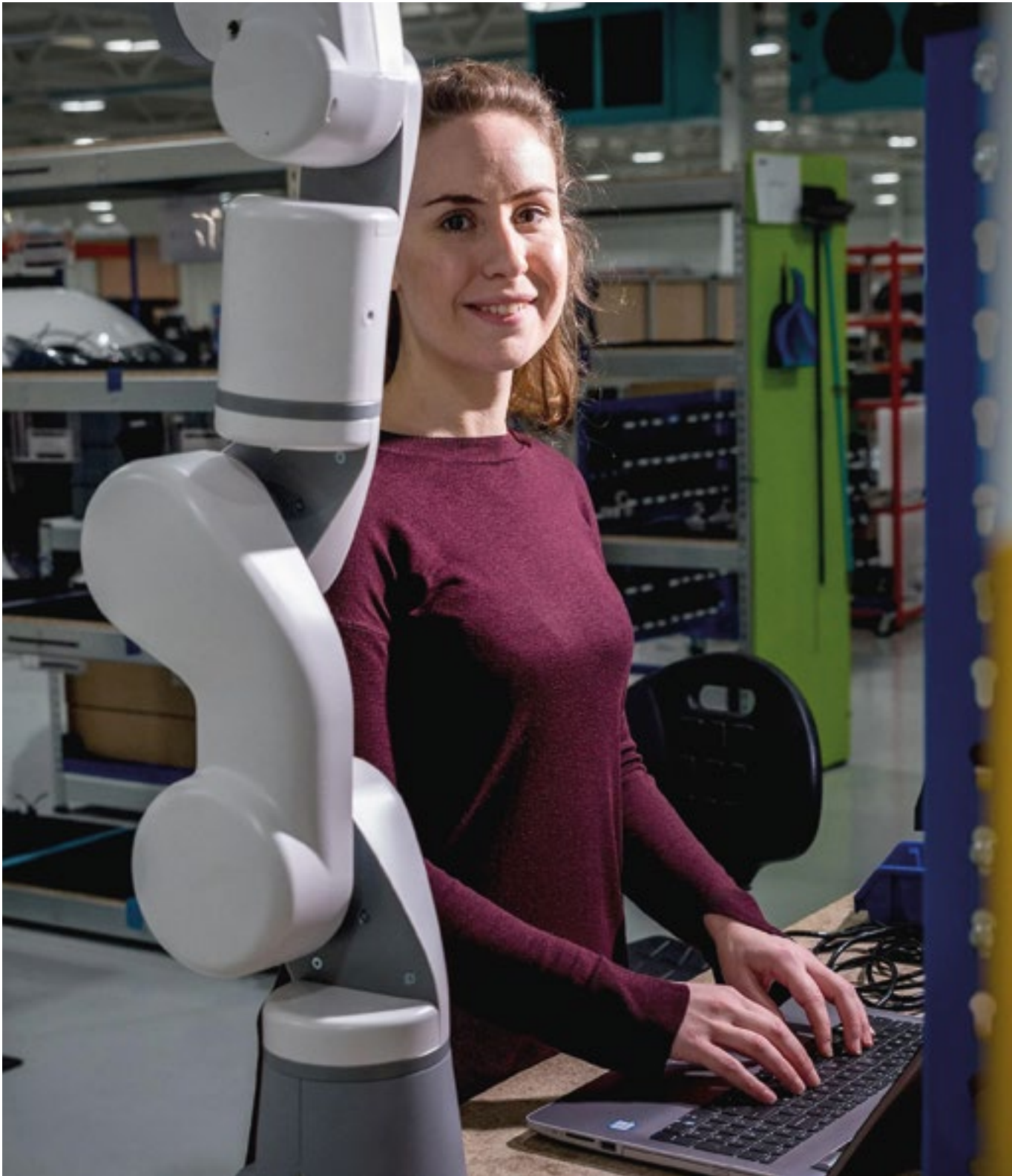
Tharsus, design and manufacture of smart machines and robots, Blyth