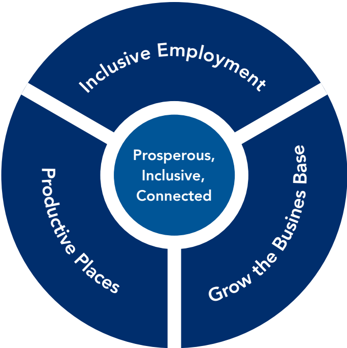
Fig 3: Economic Strategy Vision and Objectives

Our vision is therefore to be a prosperous, inclusive and connected community.