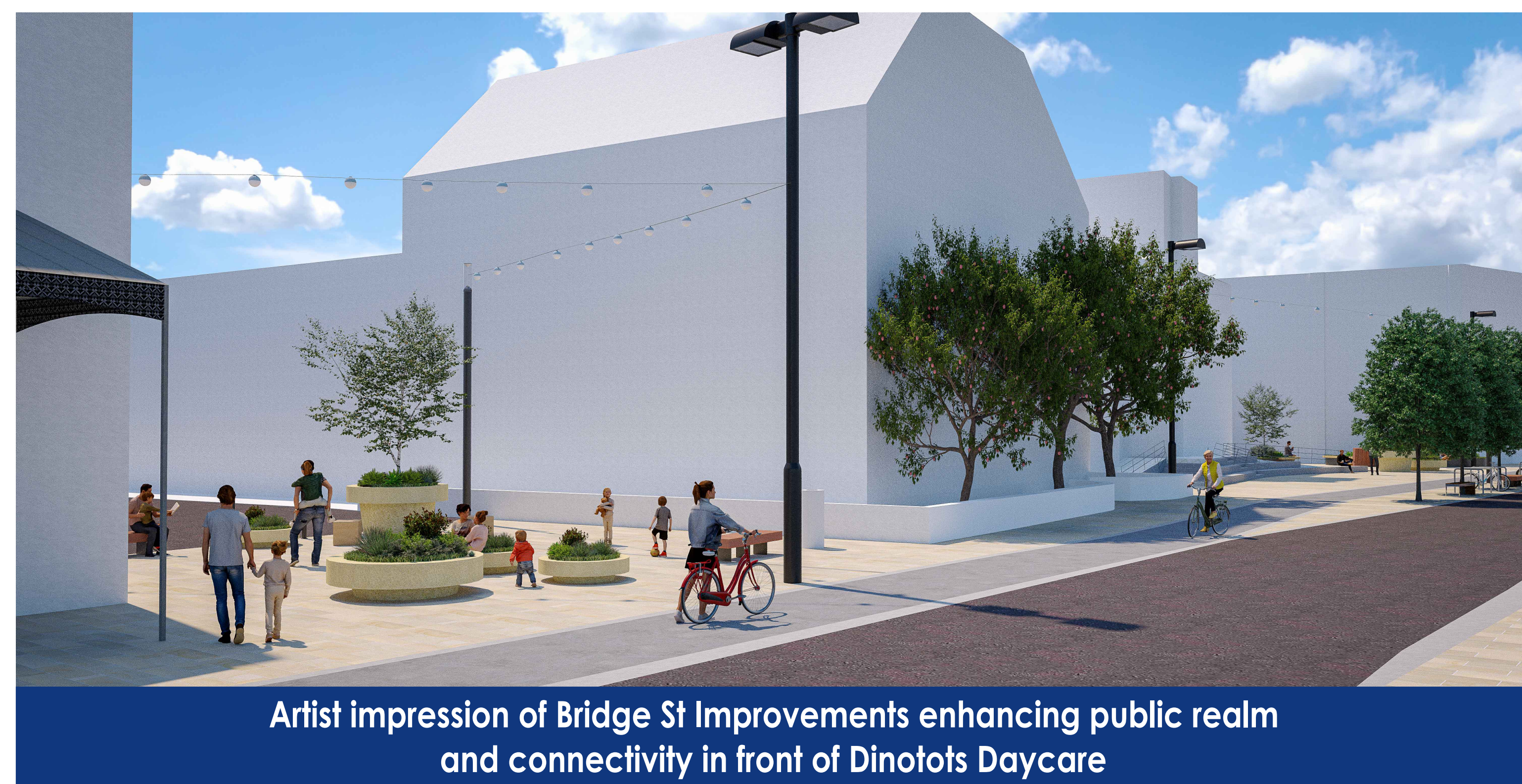
Artist impression of Bridge St Improvements enhancing public realm and connectivity in front of Dinotots Daycare

Increase active travel and reduce car journeys