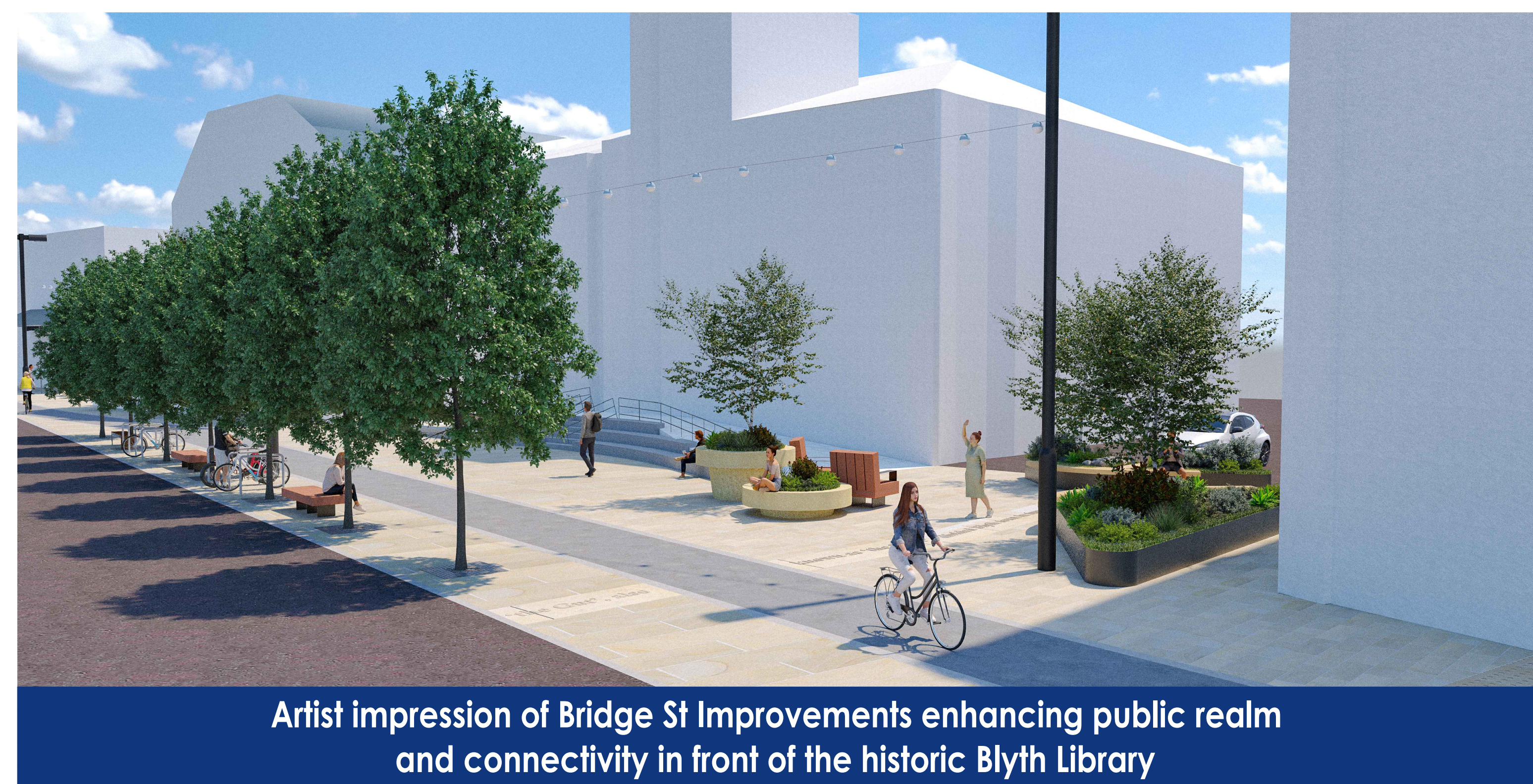
Artist impression of Bridge St Improvements enhancing public realm and connectivity in front of the historic Blyth Library