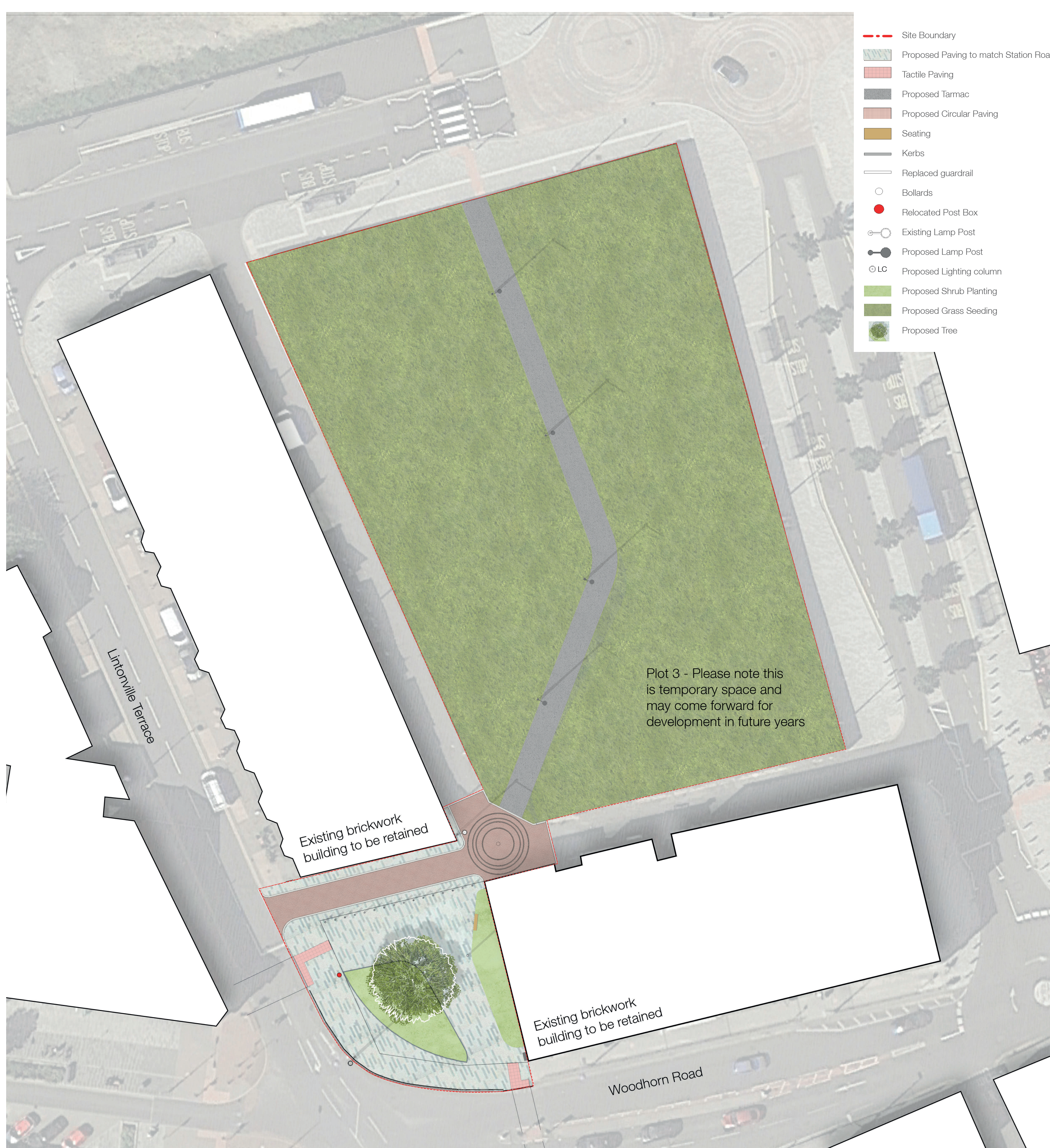
Grand Corner and Portland Park Masterplan

The paving materials palette already within the town centre will be used to extend and unify the character of the public realm.