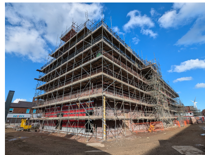
External Works to the Roof:

Monday to Friday 8am to 6.00pm Saturday 8am to 1pm Sunday 8am to 1pm (if required)