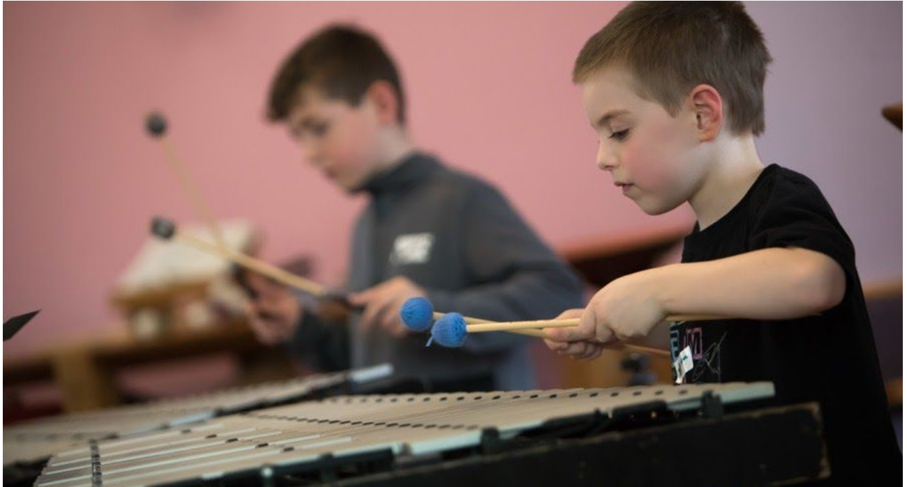
Students attending percussion workshop at Northumberland Festival of Music ( Discover Our Land Festival)